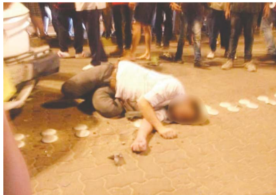
KUWAIT: The expat who was run over following a group fight outside a mall in Hawally on Saturday night.