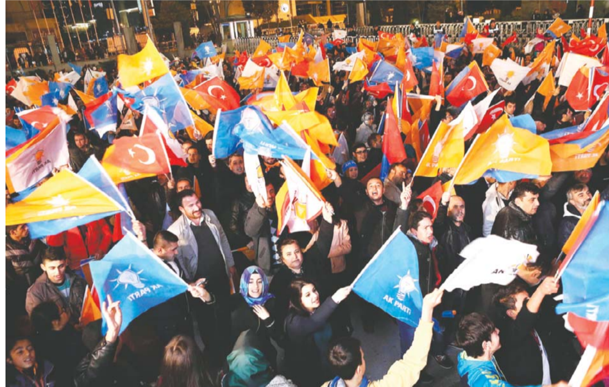
ANKARA: Supporters of Turkey's Justice and Development Party (AKP) celebrate outside the party's headquarters in Ankara after the first results in the country's general election yesterday.