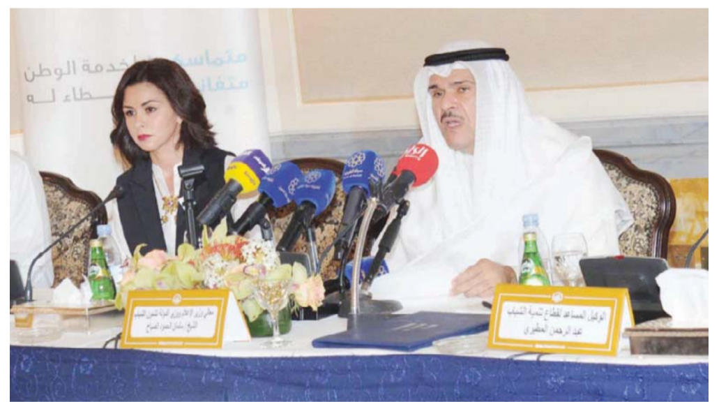
KUWAIT: Information and Youth Affairs Minister Sheikh Salman Al-Humoud Al-Sabah (right) speaks during yesterday's press conference.

Only Kuwaitis aged 14-34 are eligible to apply for the award, the first of its kind in the Arab countries. They can apply as of yesterday till 14 January, through the ministry website. Results