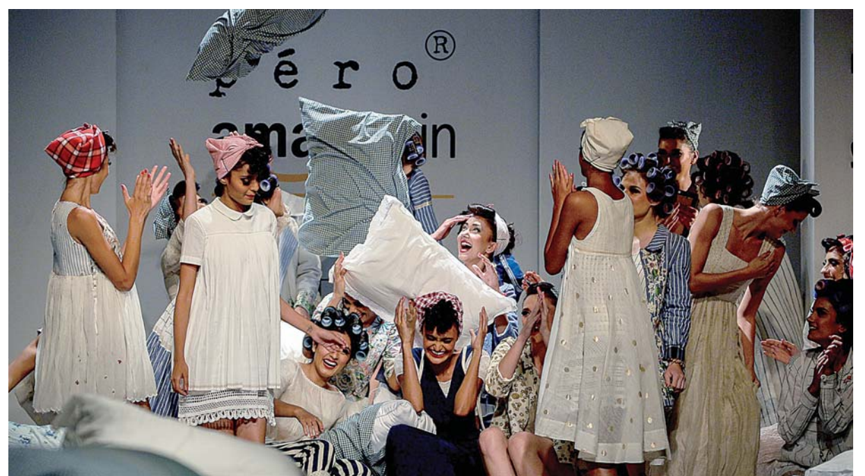
Models do the pillow fight as they present creations by Indian fashion designer Aneeth Arora during the Amazon India Fashion Week Spring Summer 2016.