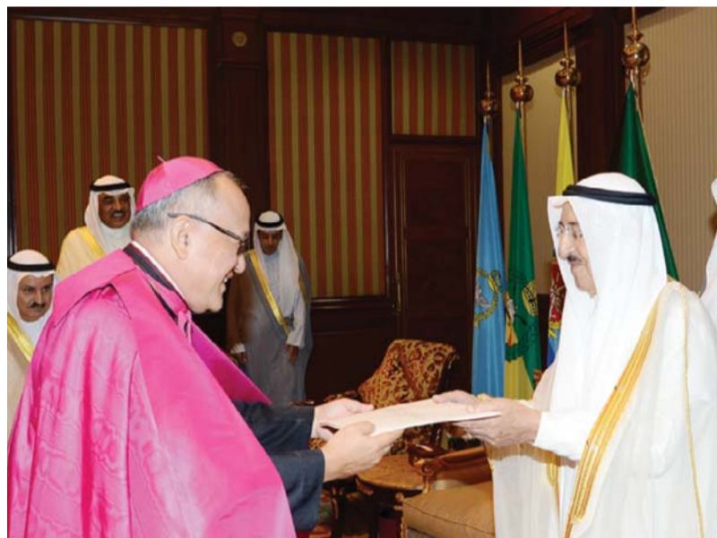
His Highness the Amir Sheikh Sabah Al-Ahmad Al-Jaber Al-Sabah receives the credentials of the new ambassador of Vatican Francisco Montecillo.