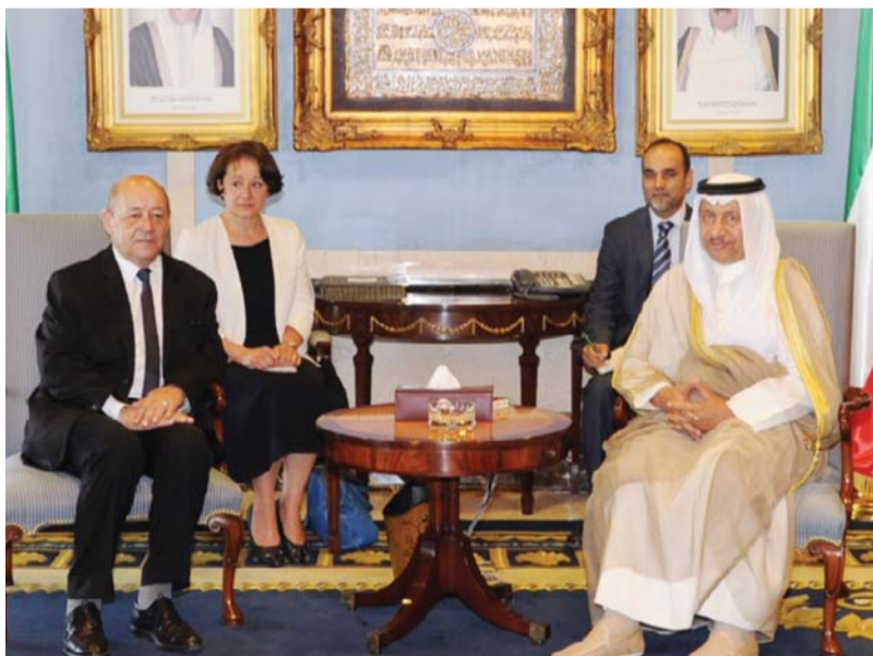
His Highness the Prime Minister Sheikh Jaber Al-Mubarak Al-Hamad Al-Sabah meets with French Defense Minister Jean-Yves Le Drian.