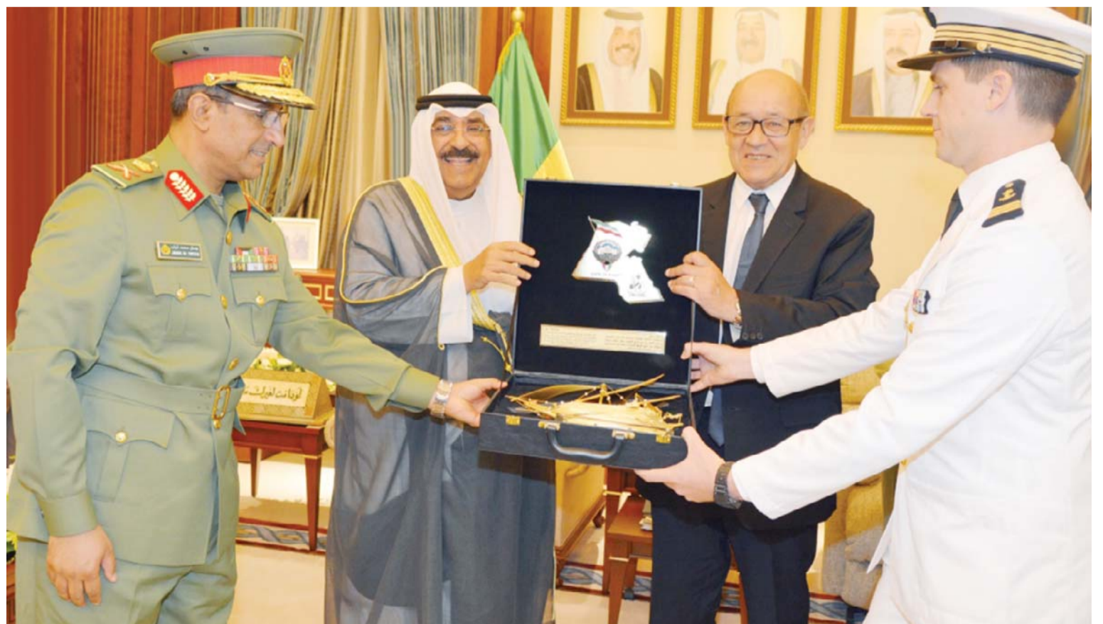
KUWAIT: Deputy Chief of the Kuwait National Guard (KNG) Sheikh Mishal Al-Ahmad Al-Jaber Al-Sabah presents a memento to French Defence Minister Jean-Yves Le Drian. — KUNA

and Paris, according to which the country would receive up to 30 French-made military helicopters, equipped with sophisticated equipment and missiles, backing up the national armed forces in combat operations. The Ministry of Defense added that the granting of the French medals to the Kuwaiti commanders came within the framework of the distinctive cooperation between the States of Kuwait and France at the defense level, as well as in recognition of the two chiefs' great and fruitful efforts and work in the army operations. — KUNA