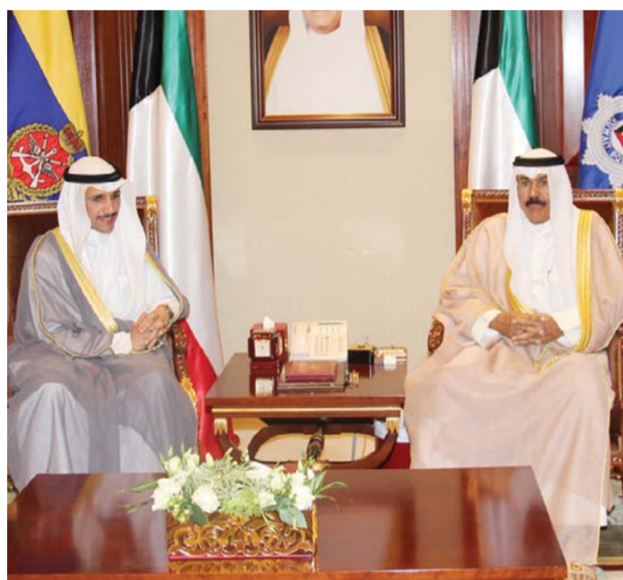
His Highness the Crown Prince Sheikh Nawaf Al-Ahmad Al-Jaber Al-Sabah meets with National Assembly Speaker Marzouq Ali Al-Ghanem.