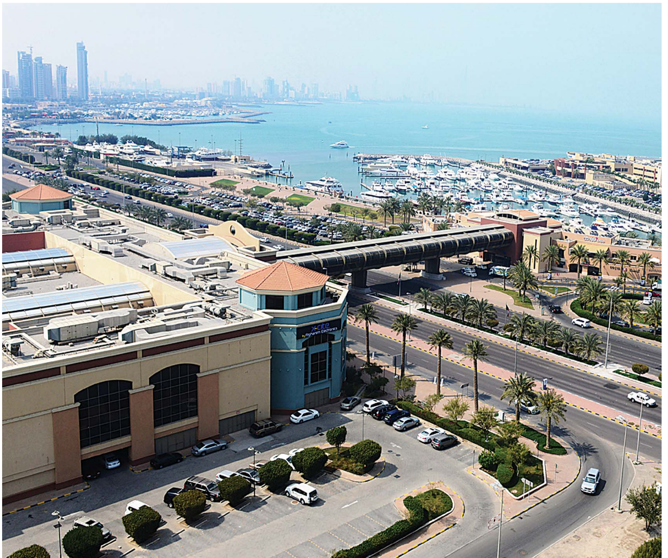
KUWAIT: The Marina Crescent, a favorite tourist destination in Kuwait.