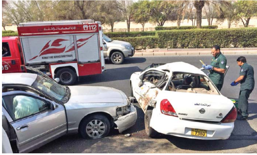
Two vehicles pictured following an accident between Jleeb Al-Shuyoukh and Abdullah Al-Mubarak.