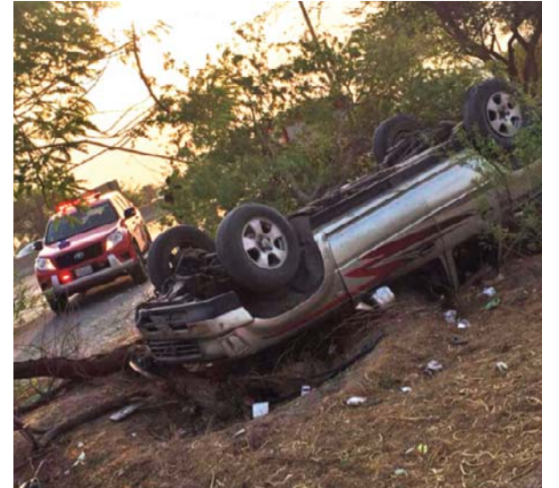
KUWAIT: A vehicle flipped over following an accident on Sixth Ring Road.