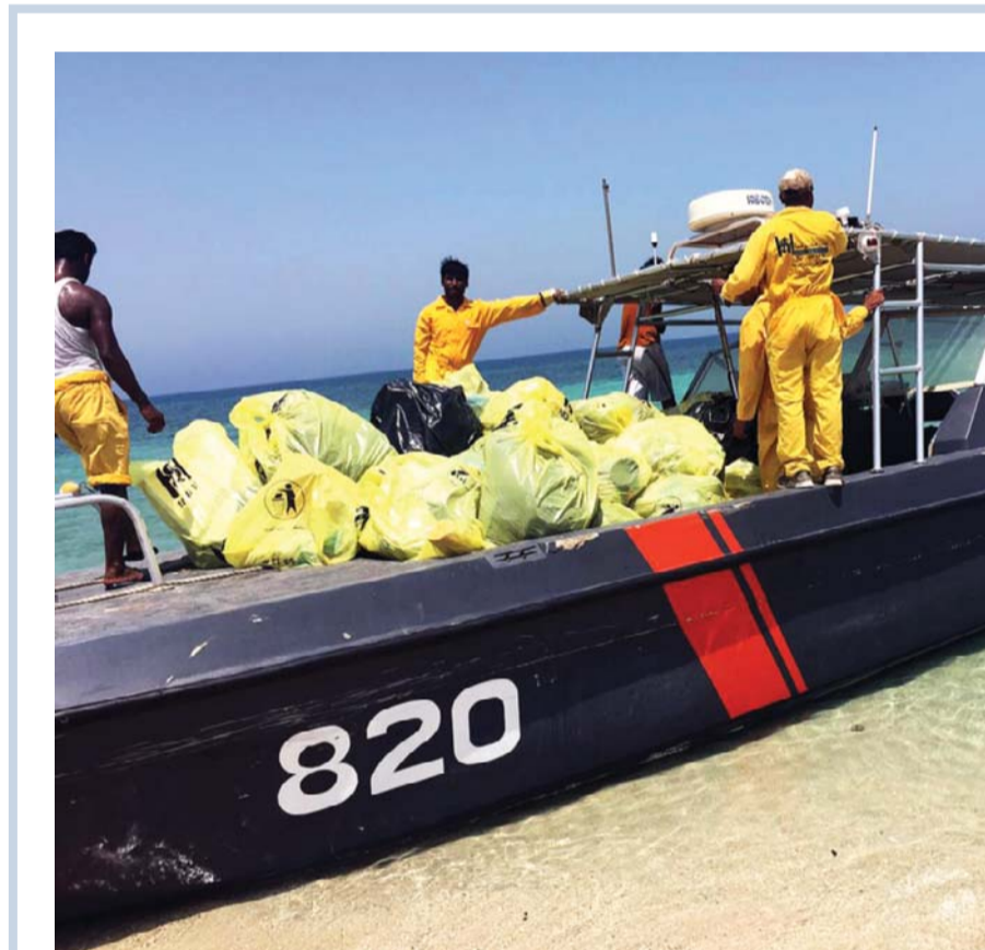
KUWAIT: The Coastguard General Department organized cleaning campaigns at Kubbar, Garouh and Um Al-Maradem islands recently in cooperation with Kuwait Municipality.