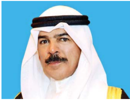
Deputy Prime Minister and Interior Minister Sheikh Mohammad Al-Khaled Al-Sabah