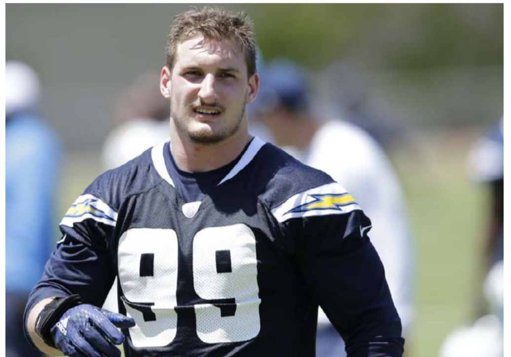
SAN DIEGO: File photo, San Diego Chargers rookie defensive end Joey Bosa trains during an NFL football rookie training camp in San Diego. Bosa's holdout has overshadowed everything else going on with the Chargers, who went public with the contract dispute.

"I trust the coaches and they obviously have a plan ready for me. I'm just not sure what that is." Bosa also discussed his mother's involvement in