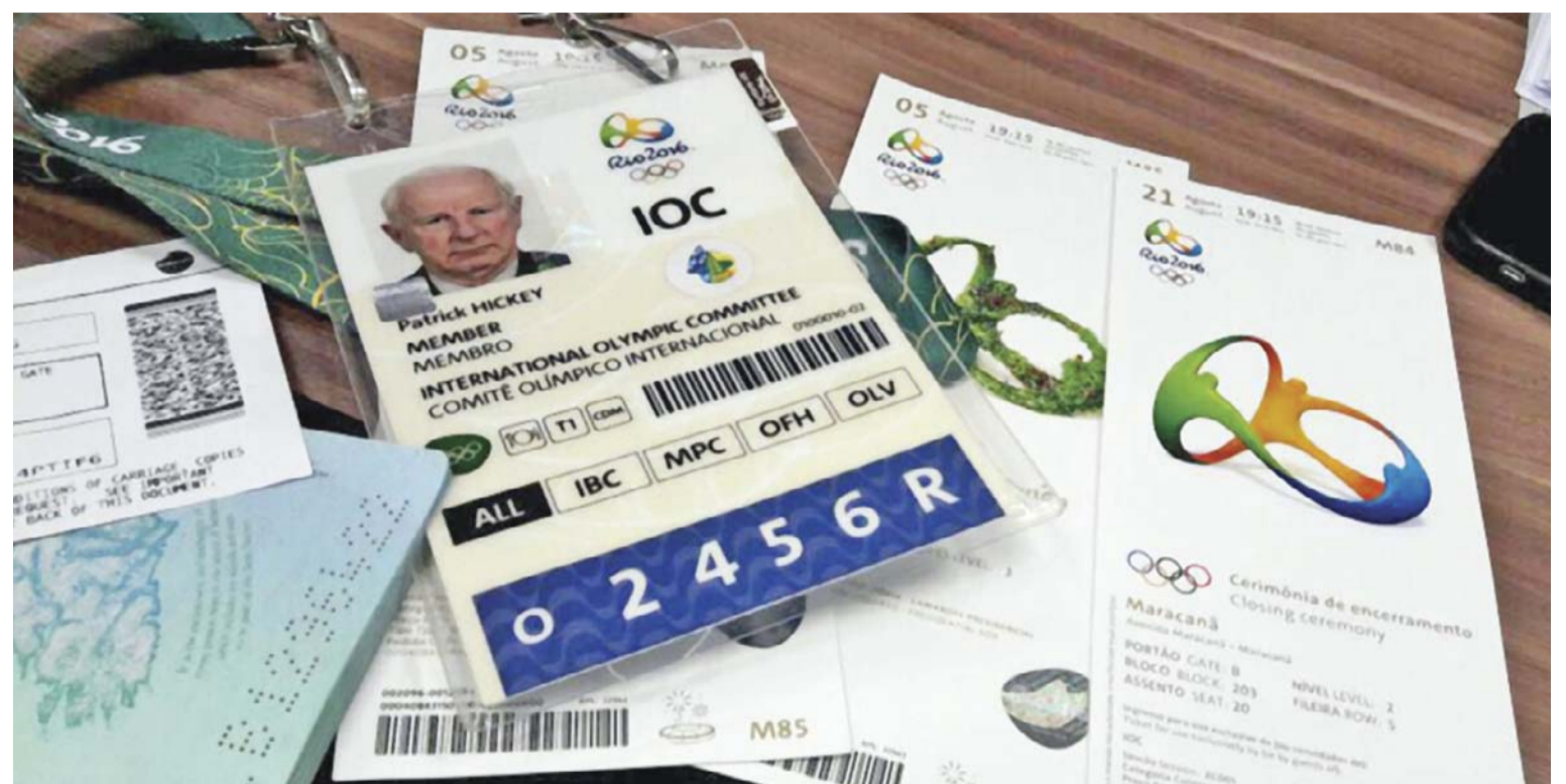
RIO DE JANEIRO: Documents belonging to Ireland's Patrick Hickey, a member of the International Olympic Committee's executive board, that include his Olympics' credential and passport are displayed alongside Olympic tickets during a police press conference in Rio de Janeiro, Brazil, Aug 17, 2016. — AP

The Bosa spat came amid the Chargers' push for a ballot initiative that will ask voters for a $1.1 billion subsidy via an increase in the hotel tax to help pay for a new stadium and convention center downtown. — AP