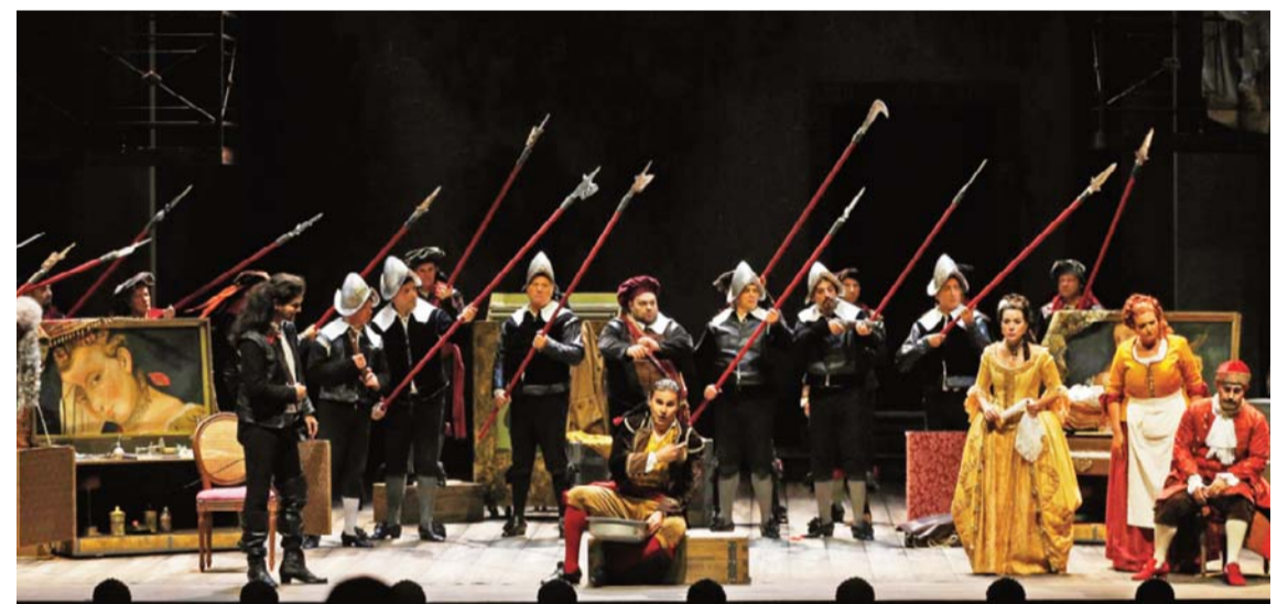
Singers perform on stage yesterday during a dress rehearsal of Gioacchino Rossini's opera "The barber of Seville" at Dubai's new opera house, on the eve of its official opening in the Gulf Emirate. A boat-shaped hulk of steel and glass at the foot of the world's tallest tower, Dubai's new opera house is set to boost the cultural life of the Gulf's business hub. The ultra-modern 2,000-seat venue was developed by Dubai-based Emaar Properties, which also built the Burj Khalifa, and can transform into three modes, operating as a theatre, concert hall and a flat-floored hall suitable for banquets and weddings.