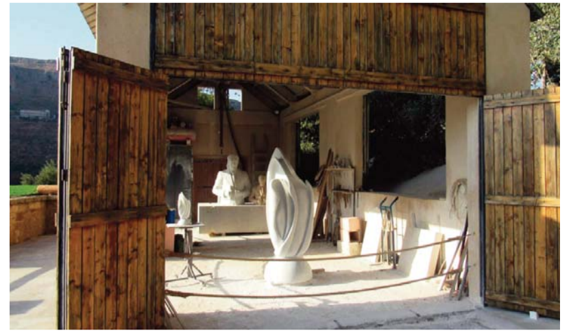
Photos show the village of Assaf in Chouf District, Mount Lebanon governorate.