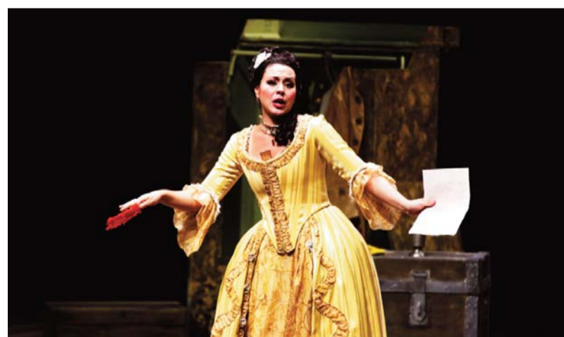
Opera singer Rocio Ignacio performs the role of Rosina in a dress rehearsal of "The Barber of Seville".