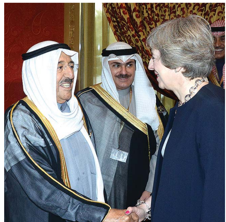
MANAMA: Gulf Cooperation Council (GCC) leaders pose for a group picture during a GCC summit in the Bahraini capital yesterday. (Right) HH the Amir of Kuwait Sheikh Sabah Al-Ahmad Al-Jaber Al-Sabah meets British Prime Minister Theresa May yesterday.