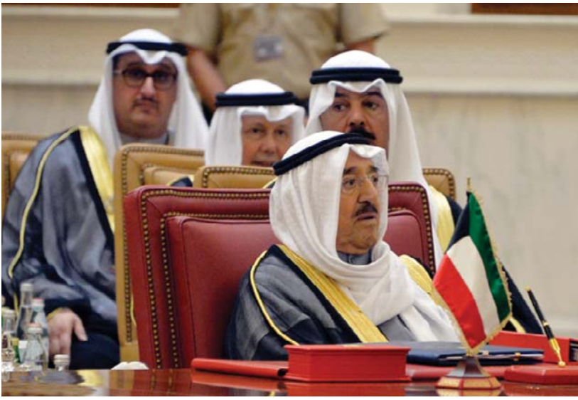
MANAMA: His Highness the Amir Sheikh Sabah Al-Ahmad Al-Jaber Al-Sabah attends the 37th Session of the Gulf Cooperation Council (GCC) Summit yesterday.