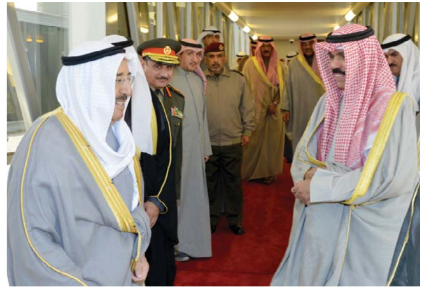
His Highness the Amir Sheikh Sabah Al-Ahmad Al-Jaber Al-Sabah is seen off at the airport by His Highness the Crown Prince Sheikh Nawaf Al-Ahmad Al-Jaber Al-Sabah.