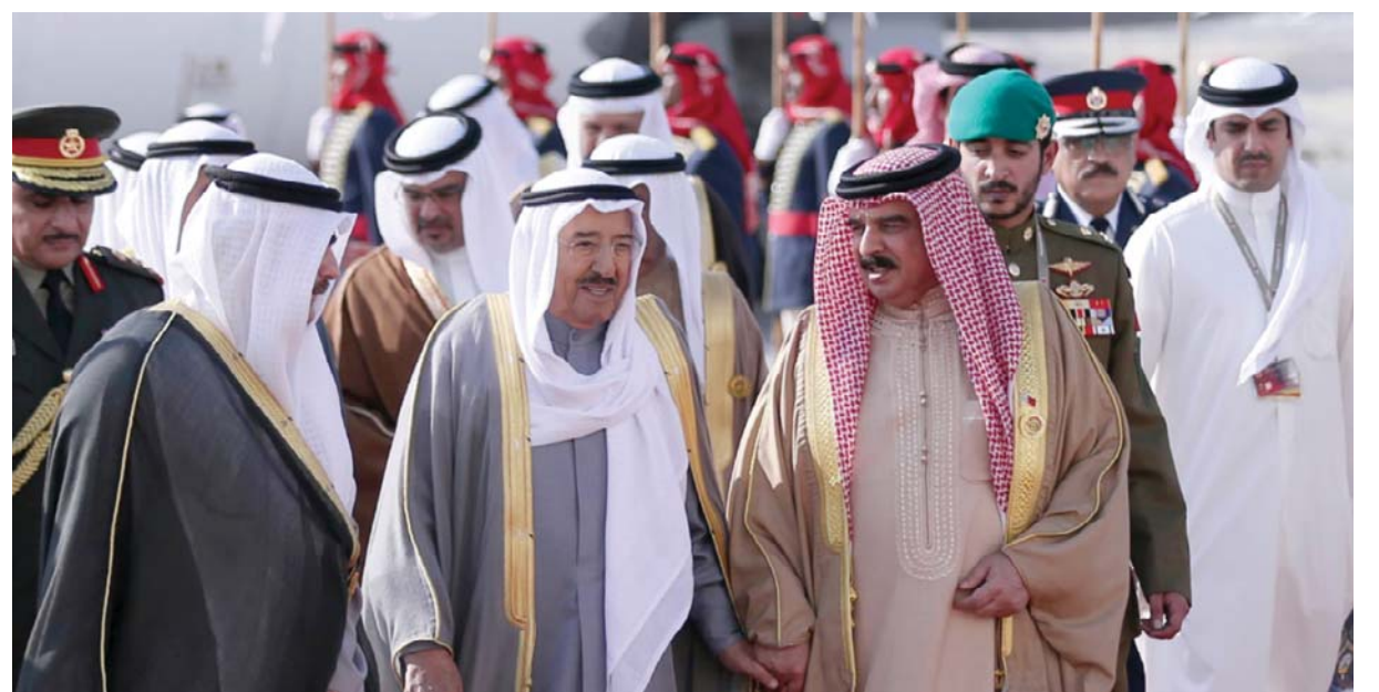
Bahraini King Hamad bin Isa Al Khalifa welcomes His Highness the Amir Sheikh Sabah Al-Ahmad Al-Jaber Al-Sabah upon his arrival to Manama.

Upon his arrival to Bahrain earlier yesterday, His Highness the Amir was received at the airport by King Hamad, as well as Bahraini Prime Minister Prince Khalifa bin Salman Al-Khalifa, Crown Prince, and Deputy Supreme Commander and First Deputy Prime Minister Prince Salman bin Hamad Al-Khalifa. He was also received by senior Royals, Shura and Representatives' Council's chairmen,