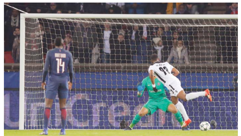
PARIS: Ludogorets' Virgil Misidjan, right, scores his team opening goal as PSG's Blaise Matuidi, left, looks on, during the Champions League Group A soccer match between Paris Saint Germain and Ludogorets yesterday.

Brazil defender Marquinhos clumsily lost possession when receiving a throw-in. He turned his back on play, allowing Brazilian forward Jonathan Cafu to steal the ball off him and burst down the left, before pulling it back to countryman Wanderson to finish with a low drive under the body of goalkeeper Alphonse Areola. PSG beat Basel 3-0 in its previous home game but it was far more difficult than the result suggested, with Basel missing several chances. This time, Ludogorets punished PSG's mistakes to secure third place and a spot in the Europa League.