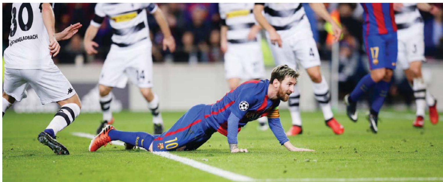
BARCELONA: Barcelona's Lionel Messi smiles during the Champions League, Group C, soccer match between FC Barcelona and Borussia Moenchengladbach at the Camp Nou stadium in Barcelona, Spain, yesterday.