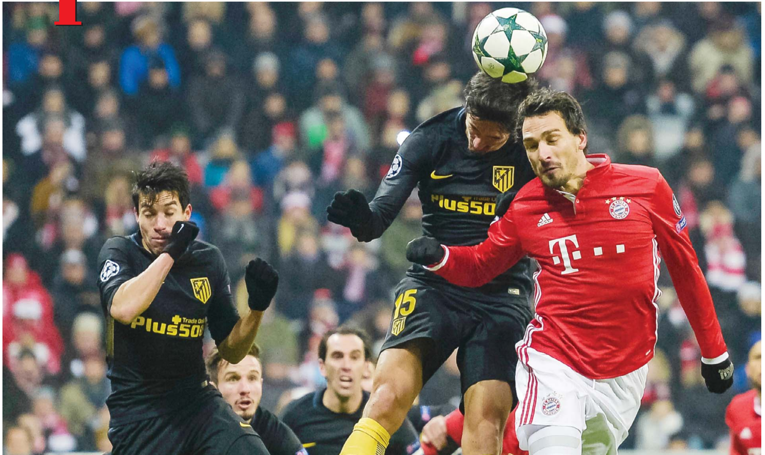
MUNICH: Atletico Madrid's Montenegrin defender Stefan Savic and Bayern Munich's German defender Mats Hummels vie for the ball during the UEFA Champions League group D football match between FC Bayern Munich and Atletico Madrid in Munich, southern Germany, yesterday.

KLAY THOMPSON SCORES 60 FOR WARRIORS IN ROUT OF PACERS Page 17