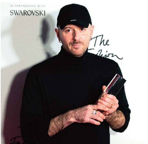
Designer Demna Gvasalia of fashion house Balenciaga poses with his award after being named winner of the International Ready-to-Wear Designer award.