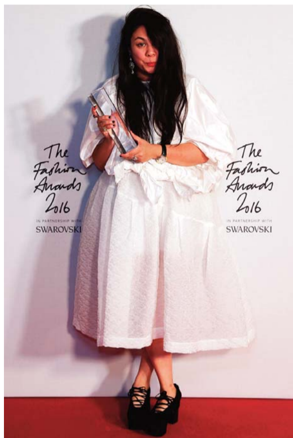
Fashion designer Simone Rocha poses with her award after being named winner of the British Womenswear Designer award.