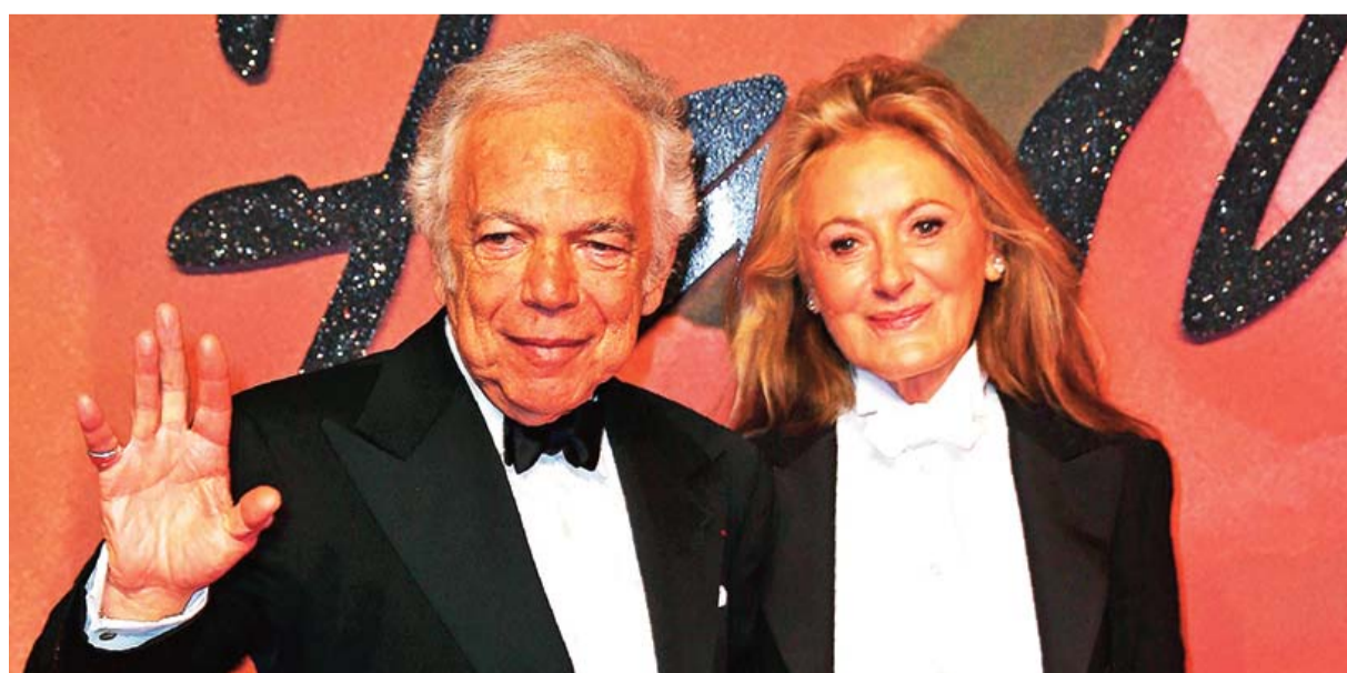
Fashion designer Ralph Lauren (left) and his wife Ricky Anne Loew-Ber pose for pictures on the red carpet upon arrival to attend the British Fashion Awards 2016.