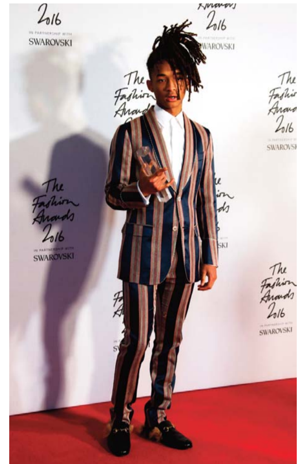
Jaden Smith poses for photographers with his new fashion Icon Award.