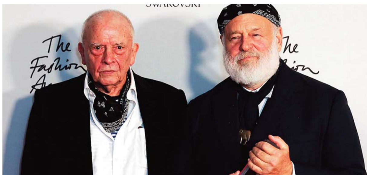
Photographer Bruce Weber (right) poses with his award after being named winner of the Isabella Blow Award for Fashion Creator award, alongside award presenter David Bailey.