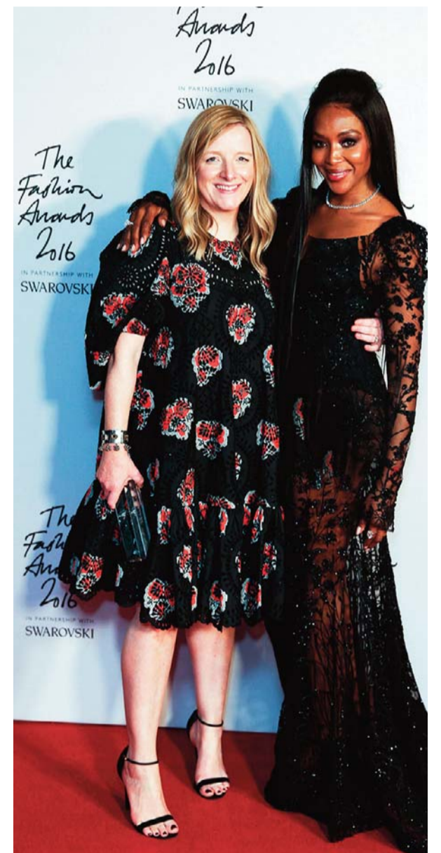
Alexander McQueen fashion designer Sarah Burton (left), poses with her award alongside the award's presenter British model Naomi Campbell, after Alexander McQueen was named winner of the British Brand award.