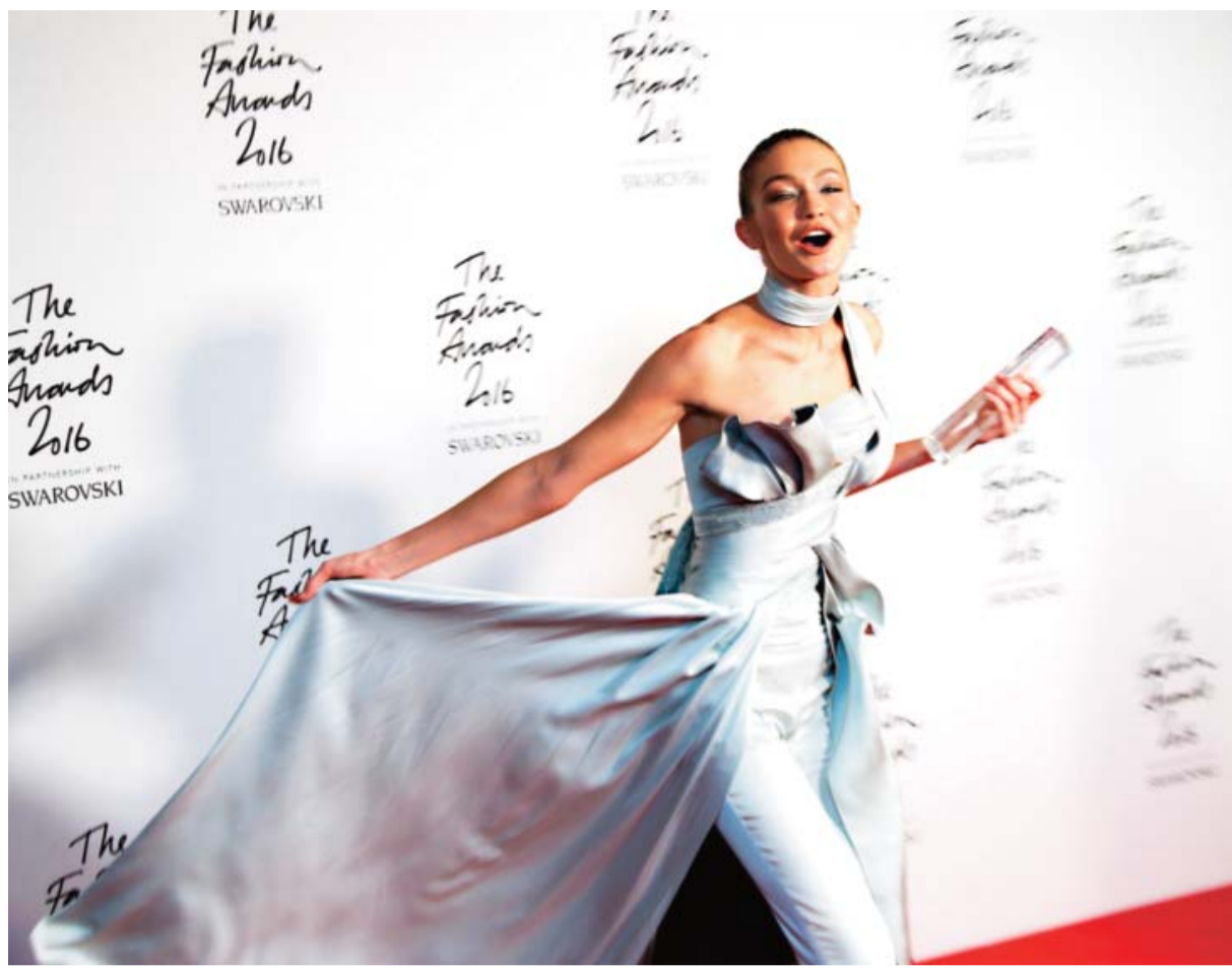
Model Gigi Hadid poses for photographers with her new International Model of the Year award.