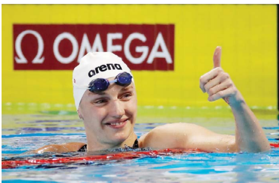
WINDSOR: Katinka Hosszu of Hungary reacts to her victory in the 400m Individual Medley final on day one of the 13th FINA World Swimming Championships (25m) at the WFCU Centre on Tuesday in Windsor Ontario, Canada.

Jones, with Borthwick in tow, has since seen the revitalised England team win 14 Tests in a row.