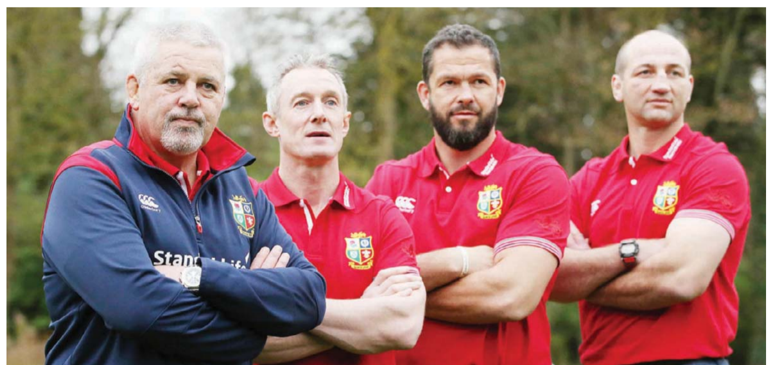
DUBLIN: British and Irish Lions coach Warren Gatland, left, with members of his coaching staff, Rob Howley, second left, Andy Farrell, second right, and Steve Borthwick pose for the media following a press conference to announce the 2017 British and Irish Lions coaching staff for next year's tour of New Zealand at Carlton House, Dublin yesterday.

The United States' quartet of Amanda Weir, Kelsi Worrell, Madison Kennedy and Mallory Comerford won the women's 4x100m free in 3:28.82 ahead of an Italian squad anchored by Pellegrini (3:30.28) and the Netherlands (3:31.10). — AFP