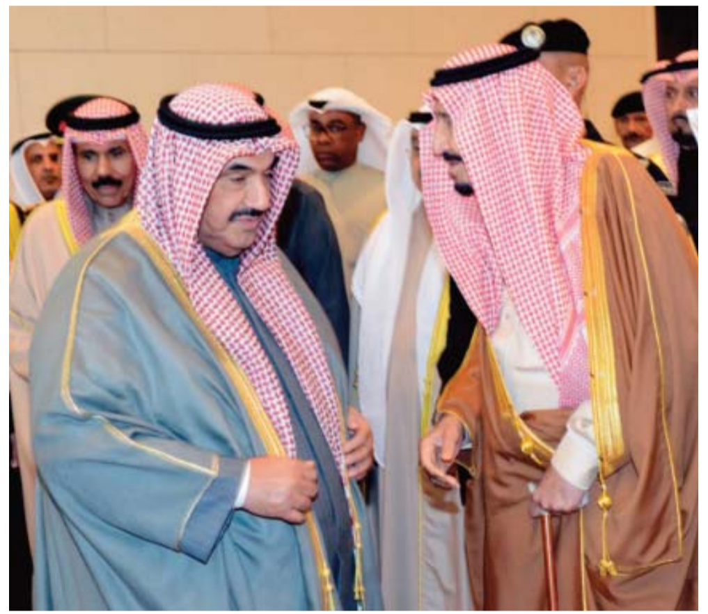
His Highness Sheikh Nasser Al-Mohammad Al-Ahmad Al-Sabah bids farewell to Saudi King Salman bin Abdulaziz Al Saud.

KUWAIT: Saudi King Salman bin Abdulaziz Al Saud left Kuwait yesterday, concluding an official two-day visit to the country where a meeting with His Highness the Amir Sheikh Sabah Al-Ahmad Al-Jaber Al-Sabah was held. He was seen off at the Kuwait international airport by His Highness the Amir Sheikh Sabah, His Highness the Crown Prince Sheikh Nawaf Al-Ahmad Al-Jaber Al-Sabah, Sheikh Jaber Al-Abdullah Al-Jaber Al-Sabah, Sheikh Faisal Al-Saud Al-Mohammad Al-Sabah, His Highness Sheikh Nasser Al-Mohammad Al-Ahmad Al-Sabah, His Highness the Prime Minister Sheikh Jaber Al-Mubarak Al-Hamad Al-Sabah, Amiri Diwan Affairs Minister Sheikh Nasser Sabah Al-Ahmad Al-Sabah, First Deputy Prime Minister and Minister of Foreign Affairs Sheikh Sabah Al-Khaled Al-Hamad Al-Sabah, head of the honorary delegation, Deputy Prime Minister and Minister of Interior Sheikh Mohammad Al-Khaled Al-Hamad Al-Sabah, Deputy Minister of the Amiri Diwan Sheikh Ali Al-Jarrah Al-Sabah, Deputy Prime Minister and Minister of Defense Sheikh Khaled Al-Jarrah Al-Sabah, Deputy Prime Minister, Minister of Finance and Acting Minister of Oil Anas Al-Saleh, ministers, senior officials of the Army, the Police, Kuwait National Guard (KNG) and the Kuwait Fire Service Directorate (KFSD). — KUNA