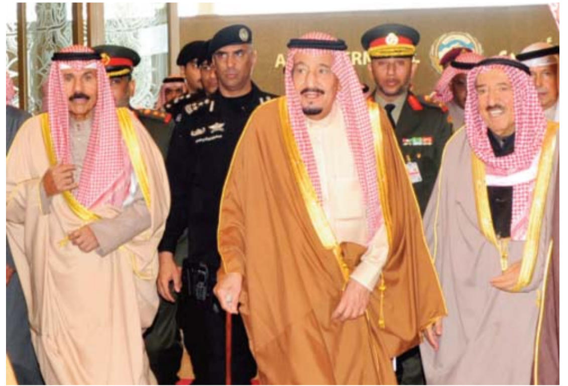
(From left) His Highness the Crown Prince Sheikh Nawaf Al-Ahmad Al-Jaber Al-Sabah, Saudi King Salman bin Abdulaziz Al Saud and His Highness the Amir Sheikh Sabah Al-Ahmad Al-Jaber Al-Sabah.