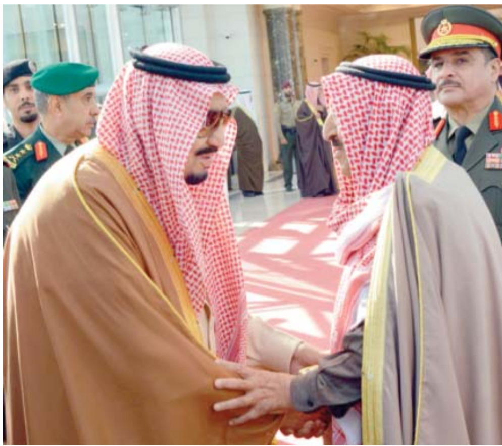
His Highness the Amir Sheikh Sabah Al-Ahmad Al-Jaber Al-Sabah bids farewell to Saudi King Salman bin Abdulaziz Al Saud.

KUWAIT: Saudi King Salman bin Abdulaziz Al Saud left Kuwait yesterday, concluding an official two-day visit to the country where a meeting with His Highness the Amir Sheikh Sabah Al-Ahmad Al-Jaber Al-Sabah was held. He was seen off at the Kuwait international airport by His Highness the Amir Sheikh Sabah, His Highness the Crown Prince Sheikh Nawaf Al-Ahmad Al-Jaber Al-Sabah, Sheikh Jaber Al-Abdullah Al-Jaber Al-Sabah, Sheikh Faisal Al-Saud Al-Mohammad Al-Sabah, His Highness Sheikh Nasser Al-Mohammad Al-Ahmad Al-Sabah, His Highness the Prime Minister Sheikh Jaber Al-Mubarak Al-Hamad Al-Sabah, Amiri Diwan Affairs Minister Sheikh Nasser Sabah Al-Ahmad Al-Sabah, First Deputy Prime Minister and Minister of Foreign Affairs Sheikh Sabah Al-Khaled Al-Hamad Al-Sabah, head of the honorary delegation, Deputy Prime Minister and Minister of Interior Sheikh Mohammad Al-Khaled Al-Hamad Al-Sabah, Deputy Minister of the Amiri Diwan Sheikh Ali Al-Jarrah Al-Sabah, Deputy Prime Minister and Minister of Defense Sheikh Khaled Al-Jarrah Al-Sabah, Deputy Prime Minister, Minister of Finance and Acting Minister of Oil Anas Al-Saleh, ministers, senior officials of the Army, the Police, Kuwait National Guard (KNG) and the Kuwait Fire Service Directorate (KFSD). — KUNA