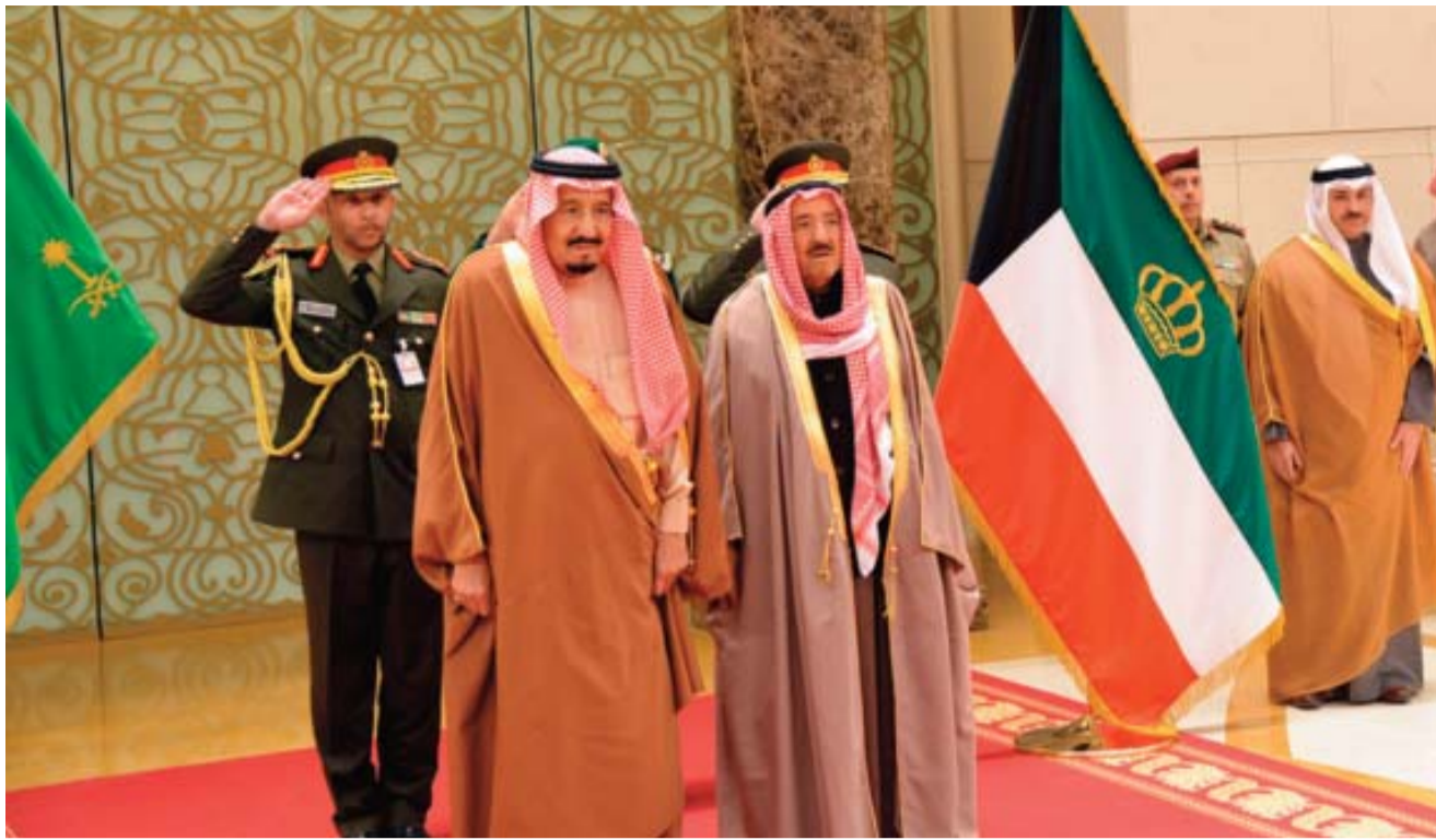
KUWAIT: His Highness the Amir Sheikh Sabah Al-Ahmad Al-Jaber Al-Sabah and Saudi King Salman bin Abdulaziz Al Saud are seen during the official farewell ceremony of the Saudi King.