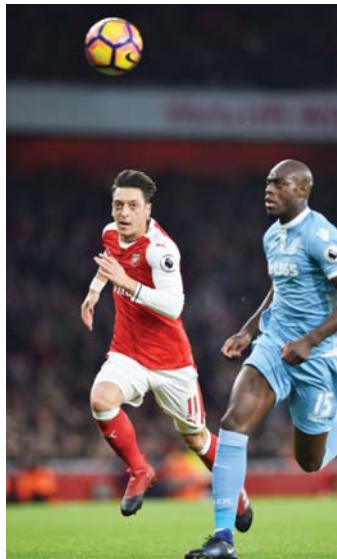
LONDON: Arsenal's German midfielder Mesut Ozil (L) runs for the ball with Stoke City's Portuguese-born Dutch defender Bruno Martins Indi during the English Premier League football match between Arsenal and Stoke City at the Emirates Stadium in London yesterday.

Moments before, Stoke had pressed forward with Pieters requiring treatment after clashing with Bellerin as he went for a far post header and the left-back had not recovered his ground when Alex Oxlade-Chamberlain