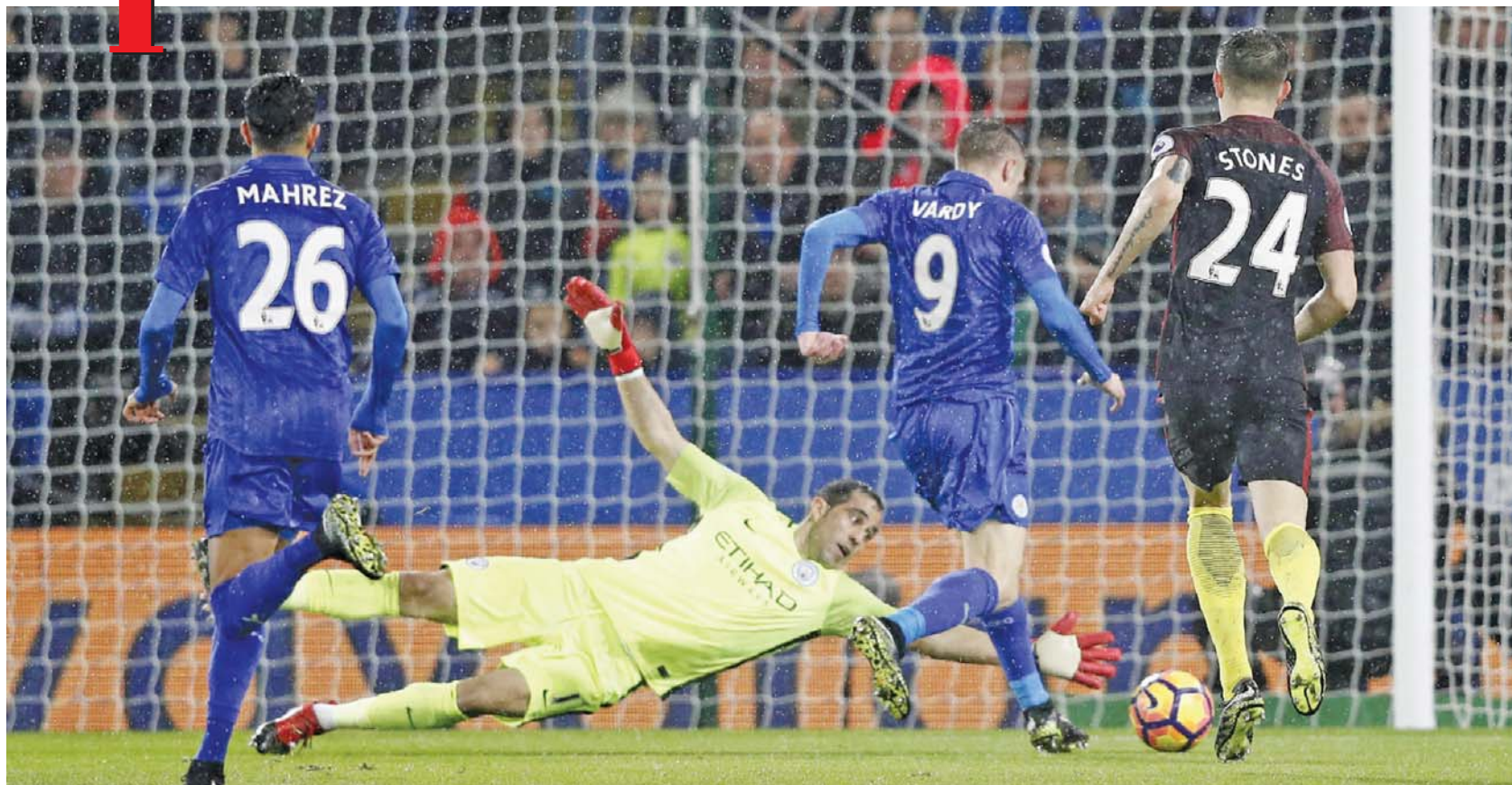
LEICESTER: Leicester City's English striker Jamie Vardy (2nd R) takes the ball around Manchester City's Chilean goalkeeper Claudio Bravo on his way to scoring their third goal during the English Premier League football match between Leicester City and Manchester City at King Power Stadium in Leicester, central England yesterday.