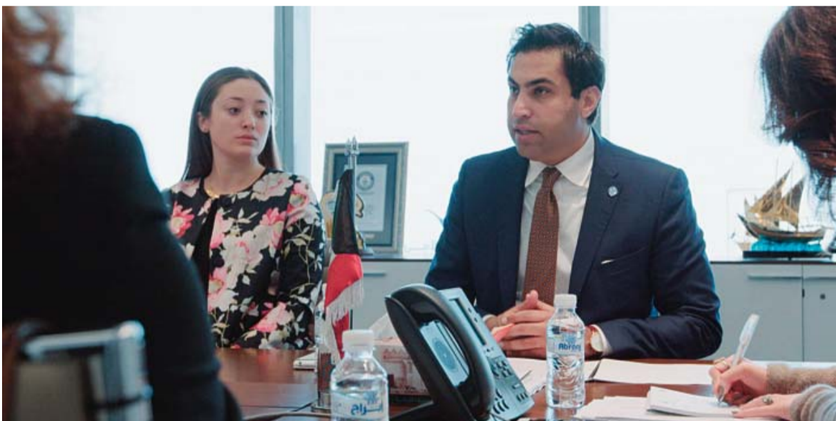
KUWAIT: The United Nations Secretary-General's Envoy on Youth Ahmad Al-Hendawi speaks during a meeting in Kuwait.

KUWAIT: The Public Authority for Youth (PAY) is set to execute about 150 programs for youth activities early 2017. The plan will be executed in cooperation with different ministries and the National Council for Culture, Arts and Letters (NCCAL), said the authority's Director-General Abdulrahman Al-Mutairi in a press statement yesterday.