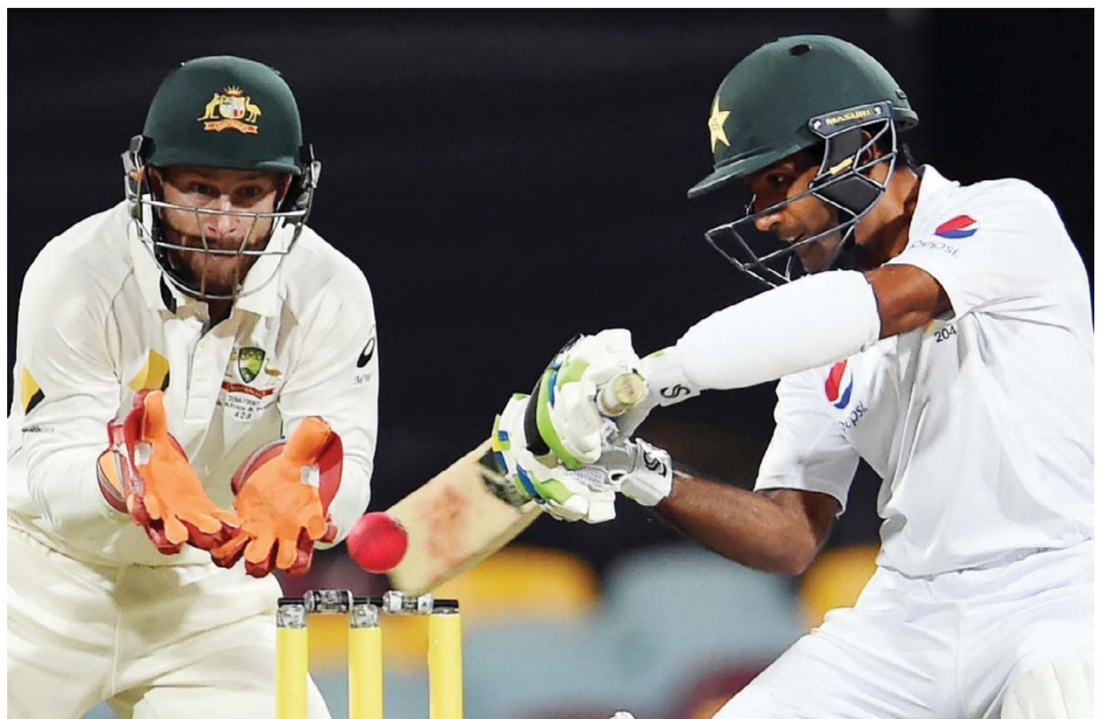
BRISBANE: Pakistan's batsman Asad Shafiq (R) plays a shot as Australia's wicketkeeper Mathew Wade (L) looks on during the fourth day of the day-night cricket Test match between Australia and Pakistan in Brisbane yesterday.