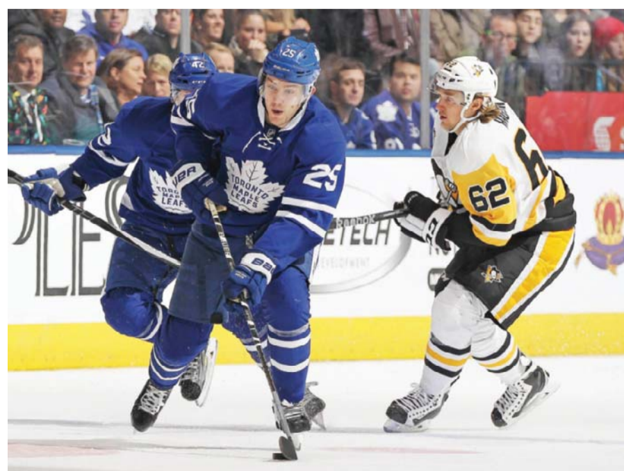
TORONTO: James van Riemsdyk #25 of the Toronto Maple Leafs skates with the puck against the Pittsburgh Penguins during an NHL game at the Air Canada Centre yesterday in Toronto, Ontario, Canada. The Maple Leafs defeated the Penguins 2-1 in overtime.