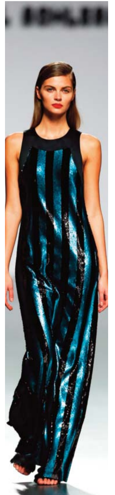
Model display the 2016 Fall/Winter designs by Francis Montesinos during the Madrid's Fashion Week.