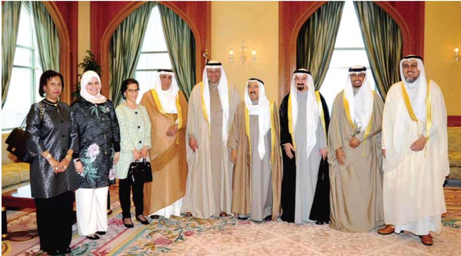
KUWAIT: His Highness the Amir Sheikh Sabah Al-Ahmad Al-Jaber Al-Sabah meets Minister of Health Dr Ali Al-Obaidi and Public Authority for Food and Nutrition officials.