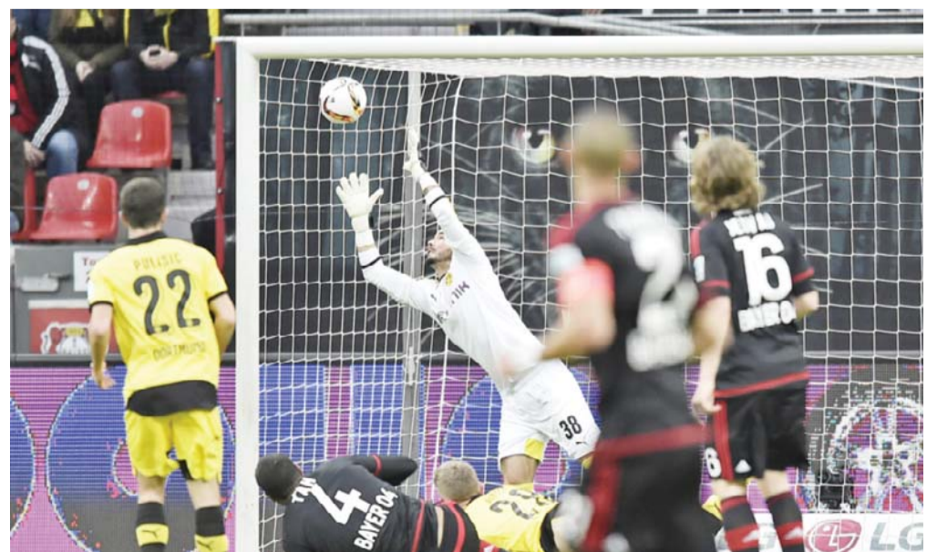
LEVERKUSEN: Dortmund's goalkeeper Roman Buerki catches the ball during the German Bundesliga soccer match between Bayer Leverkusen and Borussia Dortmund in Leverkusen, Germany, yesterday.

"Both teams can do more," Germany coach Joachim Loew said of an uneventful first half. Schalke was to host in-form Stuttgart and Hannover was facing Augsburg in a relegation battle later yesterday.