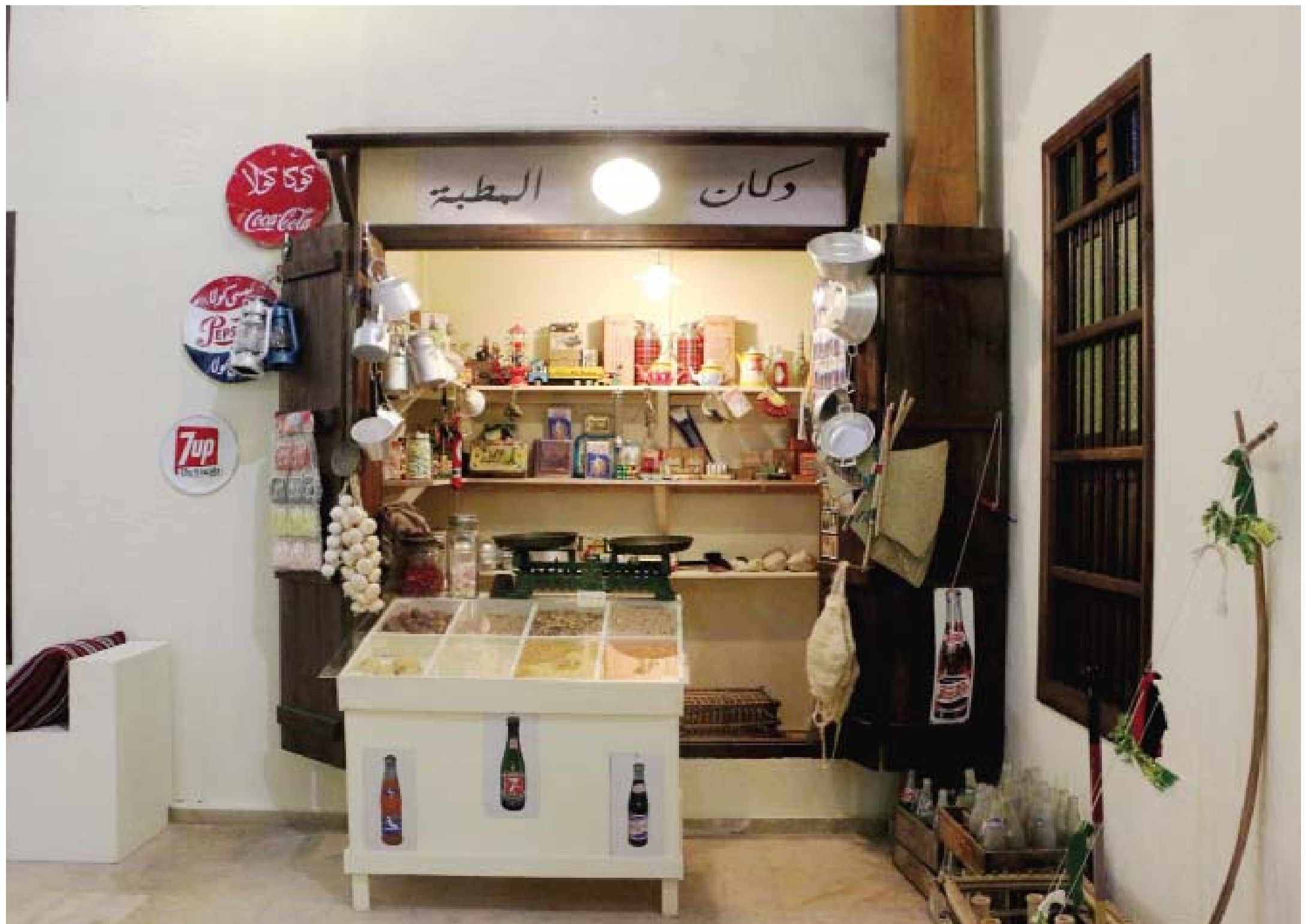
KUWAIT: A traditional grocery store in Kuwait.