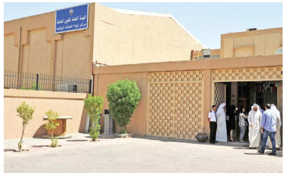
KUWAIT: The Expatriate Manpower Lodging Center.

or to enforce the law. "We have provided consultation and some training for their staff. This is just one priority in our policy, but the action must be from the Kuwaiti government," he concluded.