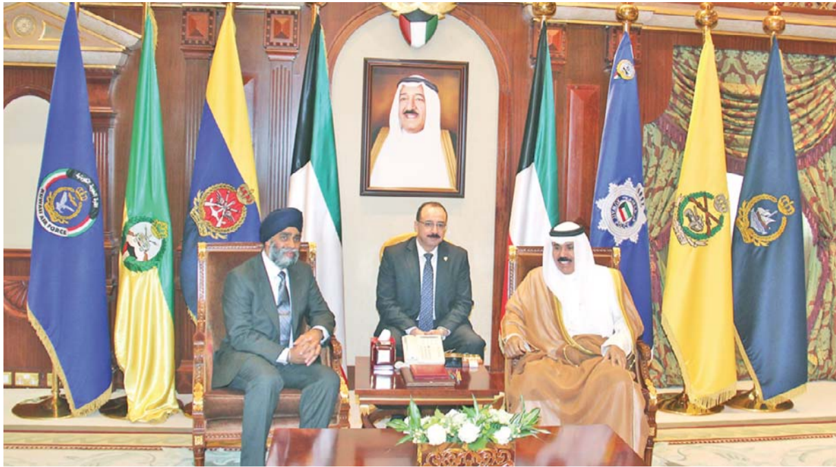
KUWAIT: His Highness the Deputy Amir and Crown Prince Sheikh Nawaf Al-Ahmad Al-Jaber Al-Sabah meets with Canadian Defense Minister Harjit Sajjan.