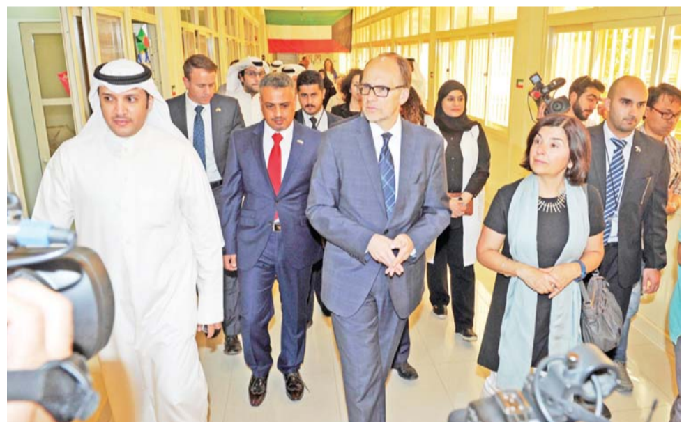
United States' Ambassador to Kuwait Douglas Silliman tours the facility.

The envoy also applauded the recent laws issued with regards to domestic helpers. "It provides shelter and legal options for women. This shelter is one example of what the government can do to help this vulnerable population. New laws have been passed for domestic helpers to give them more rights - this is very positive," he said. He also urged the Kuwaiti government to implement the laws recently passed, including a new anti-trafficking law, with the help of the ministry of inter-