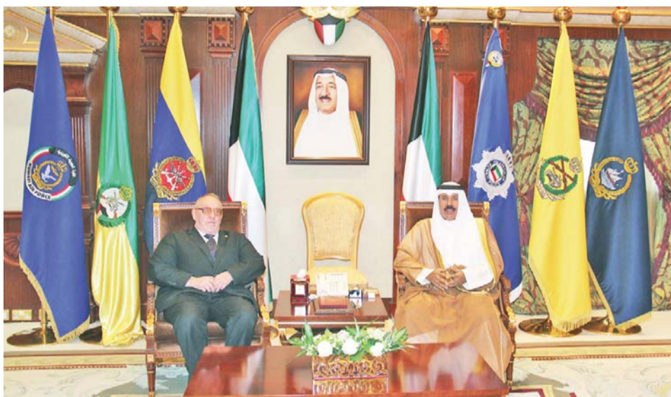
His Highness the Deputy Amir and Crown Prince Sheikh Nawaf Al-Ahmad Al-Jaber Al-Sabah meets with Bulgarian ambassador in the country Alexandar Olshevski.

KUWAIT: His Highness the Deputy Amir and Crown Prince Sheikh Nawaf Al-Ahmad Al-Jaber Al-Sabah received yesterday at Bayan Palace acting Prime Minister and Foreign Minister Sheikh Sabah Al-Khaled Al-Hamad Al-Sabah.