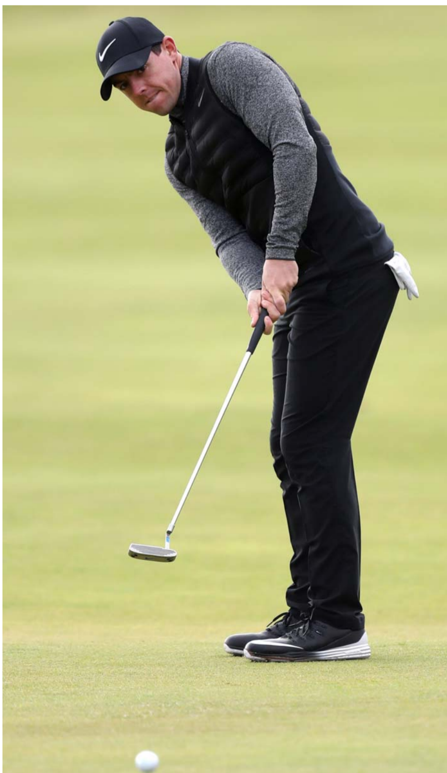
TROON: Rory McIlroy of Northern Ireland putts on the 16th green during a practice round ahead of the British Open Golf Championship at the Royal Troon Golf Club in Troon, Scotland, yesterday.

"It was very disappointing to miss last year but I'm determined not to miss any more for the foreseeable future and it's great to be back and have another chance to win another Claret Jug," added world number four McIlroy. The year's third major begins on Thursday. — Reuters