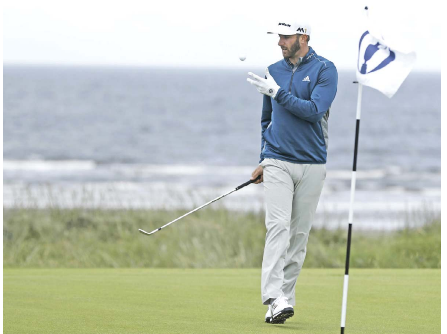
TROON: Dustin Johnson of the United States picks up his ball after playing the 5th green during a practice round ahead of the British Open Golf Championship at the Royal Troon Golf Club in Troon, Scotland, yesterday. The British Open starts today.

The latter was involved in a three-way play-off in St Andrews last year that was won by the American Zach Johnson. It was played out in gloomy conditions on the Monday after wind and rain delayed the finish. The hope is for calmer weather this year, although Friday is expected to be particularly wet and the wind coming in from the Firth of Clyde is bound to make life difficult. "If you get it breezy, like in any Open venue, this place really shows its teeth. I think it's a fantastic Open venue and a fantastic test of golf," acknowledged the current Masters champion Danny Willett. — AFP