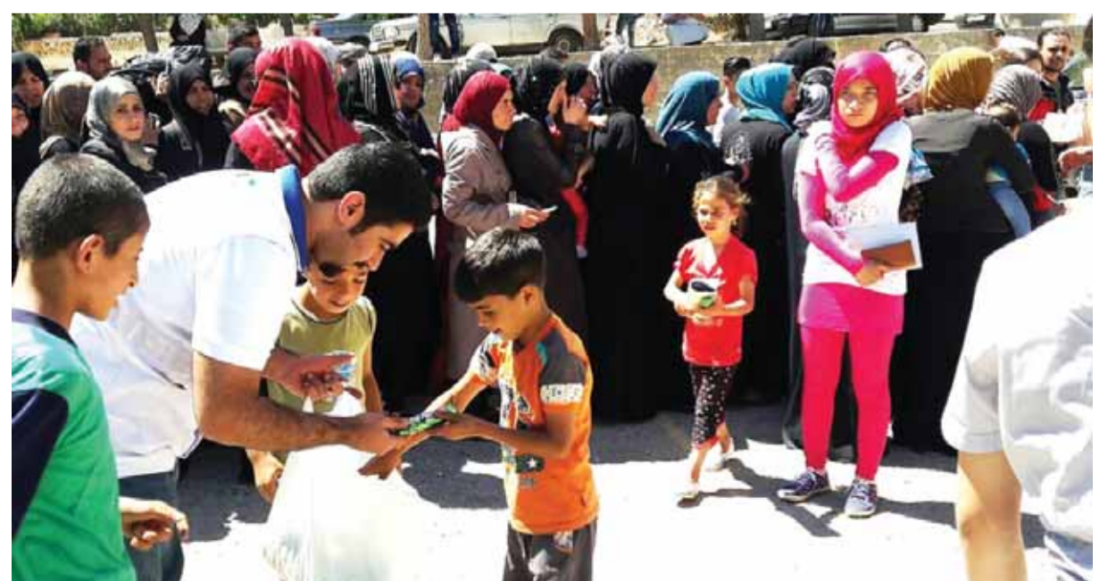
IRBIL/BEIRUT: These handout photos released by the Kuwait Red Crescent Society (KRCS) shows KRCS workers deliver aid to displaced people with special needs in Irbil, Iraq, as well as Syrian refugees in Lebanon.