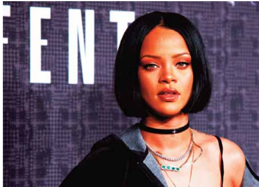
NEW YORK: Rihanna attends the JFENTY PUMA by Rihanna fashion show on Feb. 12, 2016.