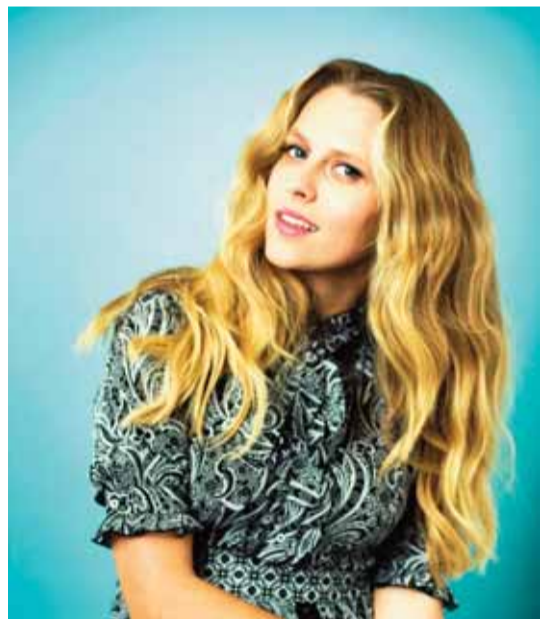
NEW YORK: Actress Teresa Palmer, star of the horror film, "Lights Out," poses for a portrait on July 18, 2016.

After appearing in nine films since 2014, Palmer says she's planning a "year of no." When she resumes working, she looks forward to taking her children to the set. "I have the luxury of being able to work and being a mama because Hollywood is really embracing working moms these days, so I can bring my son everywhere. He's traveled to every film set. I haven't spent a day away from him. Every day he's with me. It's nice you have so much downtime as an actor that you're in your trailer with your family, you go and shoot for a little bit and then you're back with your family again." —AP