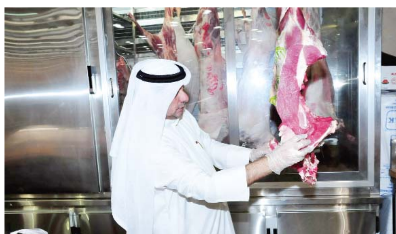
A Kuwait Municipality inspector checks the quality of meat during a campaign in Farwaniya.