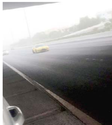
This photo provided by the Interior Ministry shows a sports car involved in an illegal race.

The Ministry of Interior's relations and security media department announced that the decision to unblock traffic fines committed in 2015 and earlier would remain in effect during Ramadan, except those related to driving without driving licenses for non-Kuwaitis, speeding and violations committed in 2016. The department added that fines could be paid online at the ministry's website, various traffic departments and at citizen