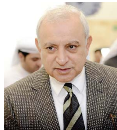
Minister of Education Dr Bader Al-Essa

tion process. Responding to a question about scholarships, Essa denied they were reduced this year, and stressed that the numbers are still the same - 6,000 foreign and 4,000 local scholarships. In other news, Kuwait University employees syndicate expressed criticized the 'sudden decision' in issuing the government universities law separating Kuwait University from the new Sabah Al-