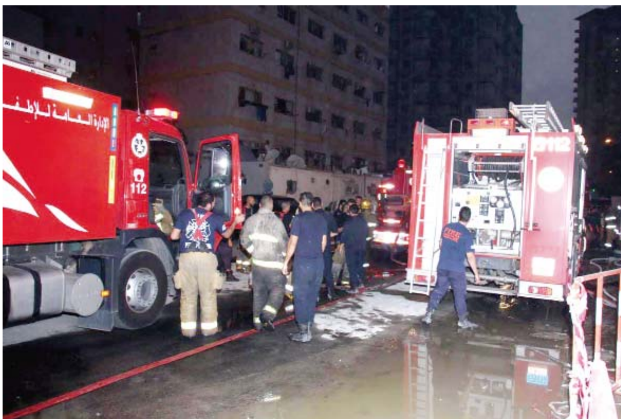
Firefighters stand outside a building in Bneid Al-Gar where a fire was reported.