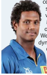
TABLE TENNIS PRODIGY LOOKS FORWARD TO 2020 OLYMPICS

MALAHIDE: Sri Lanka captain Angelo Mathews said his side will have to be at their best to beat England in the five-match one-day international series which starts tomorrow. Mathews was speaking after overseeing a 2-0 ODI series victory over Ireland in Malahide after the second match was won by an emphatic 136-run margin on Saturday. Opening batsman Kusal Perera, who would have missed the tour had a drugs ban not been rescinded following a faulty doping analysis, made a century to build the platform for his side's huge total of 377 for 8. "We still can improve a lot in all departments. It was a pretty convincing victory today, but we need to be at our best to beat England," said Mathews. Eoin Morgan's England have improved dramatically in 50-over cricket since the Sri Lankans thrashed them by nine wickets in Wellington during last year's World Cup. Saturday's win was set up by dynamic top-order batting, and Mathews said: "Perera and Danuska Gunathilaka had a brilliant opening partnership (147) and after that solid foundation it was a tactical decision to bring in the pinch-hitter and take the game forward." — AFP