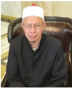
Malaysia's Mufti Dr Zulkifli Al-Bakri

KUWAIT: The visiting Malaysian Mufti Dr Zulkifli Mohamad Al-Bakri has praised Kuwait's humanitarian initiatives which extended aid to afflicted people in many world countries. In exclusive statements yesterday during his first visit to Kuwait, Dr Bakri expressed pride over Kuwait, saying that the GCC country was a major source of humanitarian and charity work around the globe. The Mufti also lauded the UN honoring of His Highness the Amir Sheikh Sabah Al-Ahmad Al-Jaber Al-