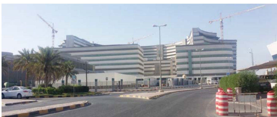
The Jaber Al-Ahmad Hospital