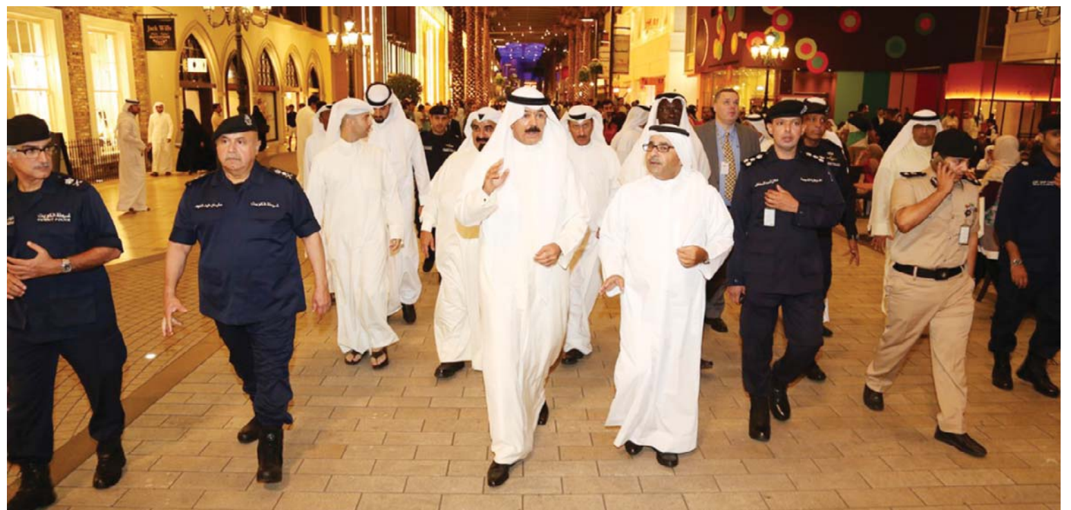
KUWAIT: Deputy Prime Minister and Interior Minister Sheikh Mohammad Al-Khaled Al-Sabah toured the Avenues Mall to check security measures at the often crowded facility. Top Interior Ministry officials accompanied the minister during the tour.

Zain's social and CSSR campaign during the Holy Month of Ramadan includes an extensive array of initiatives and programs that will focus on helping less fortunate people to enjoy Ramadan happily, as well as celebrating the true spirit the Holy month brings.