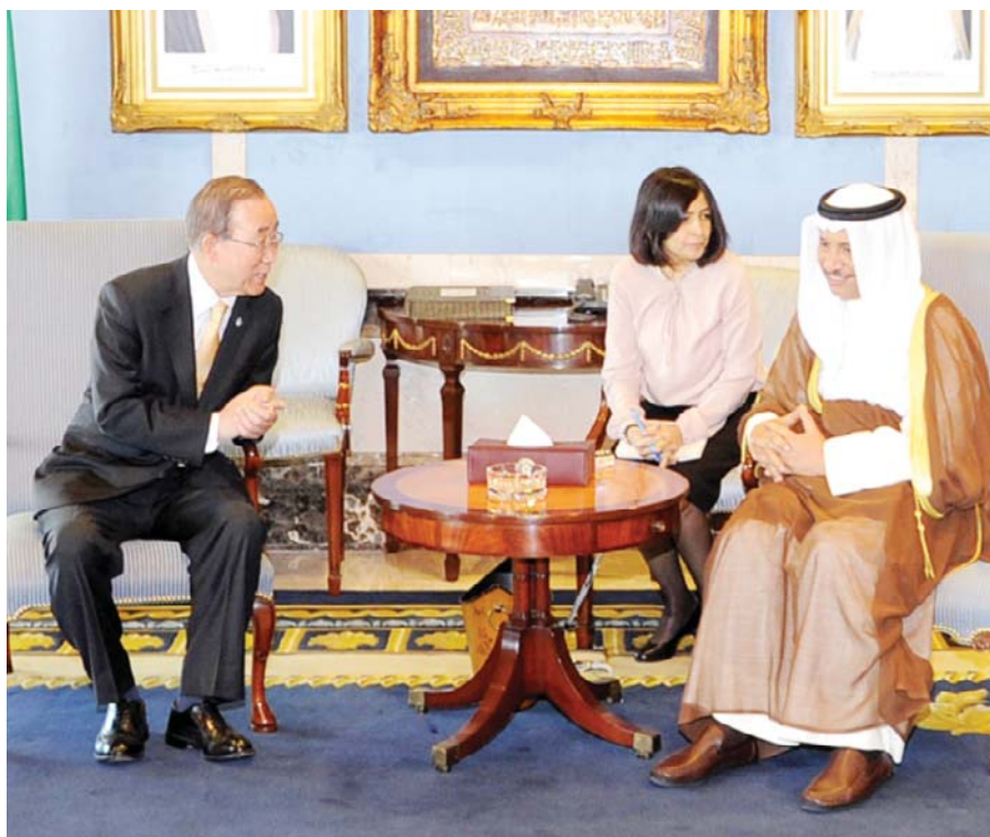
KUWAIT: His Highness the Prime Minister Sheikh Jaber Al-Mubarak Al-Hamad Al-Sabah meets with UN Secretary General Ban Ki-moon.