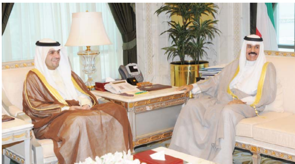
His Highness the Crown Prince Sheikh Nawaf Al-Ahmad Al-Jaber Al-Sabah meets with Deputy Prime Minister and Minister of Finance and Acting Minister of Oil Anas Al-Saleh.