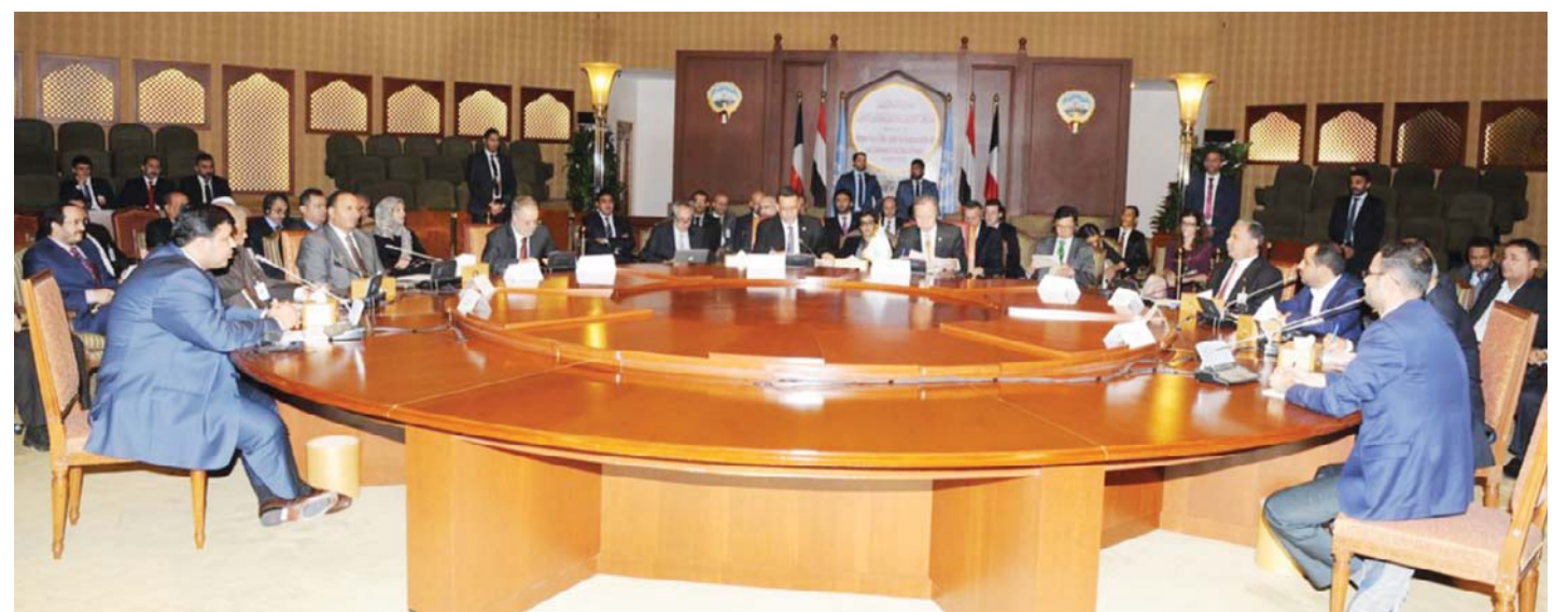
KUWAIT: United Nations Secretary General Ban Ki-moon and UN Special Envoy for Yemen Ismail Ould Cheikh Ahmad attend a session for the UN-mediated Yemeni peace talks on Sunday.

Ban said it was His Highness the Amir's "compassionate leadership" that contributed to easing suffering of millions of Syrian people who were either internally displaced or refugees in neighboring and European countries. "He is a real humanitarian champion," he added. His Highness the Amir, during his reception of the UN chief, decorated Ban with Kuwait Order of Excellence as a token of appreciation for his efforts to promote peace all over the world.