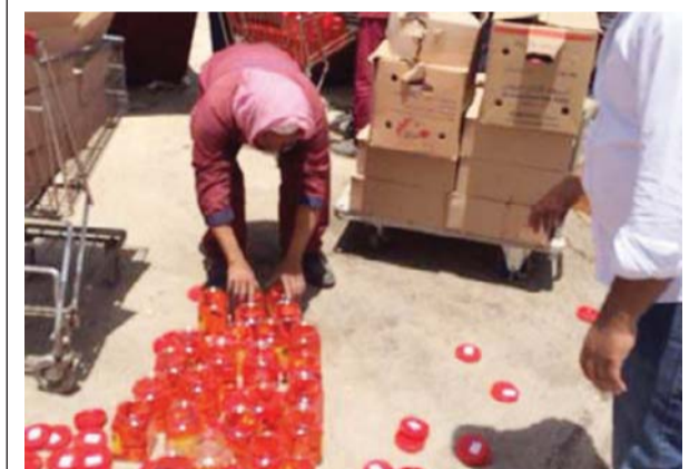
Municipality workers destroy material that did not match standard specifications.