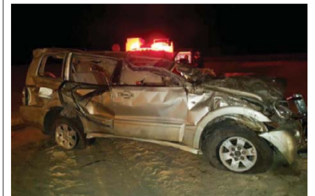
KUWAIT: The victims' vehicle pictured following the accident.

This initiative is part of the global #WithRefugees campaign, which asks the world to stand together with refugees. UN High Commissioner for Refugees Filippo Grandi spoke about why UNHCR was making such a public call to support refugees: "The #WithRefugees campaign and petition aims to amplify those voices of welcome and show that the world stands with refugees." As Kuwait is an International Humanitarian Center, it is taking the initiative by raising awareness and organizing several events in line with the #WithRefugees campaign.