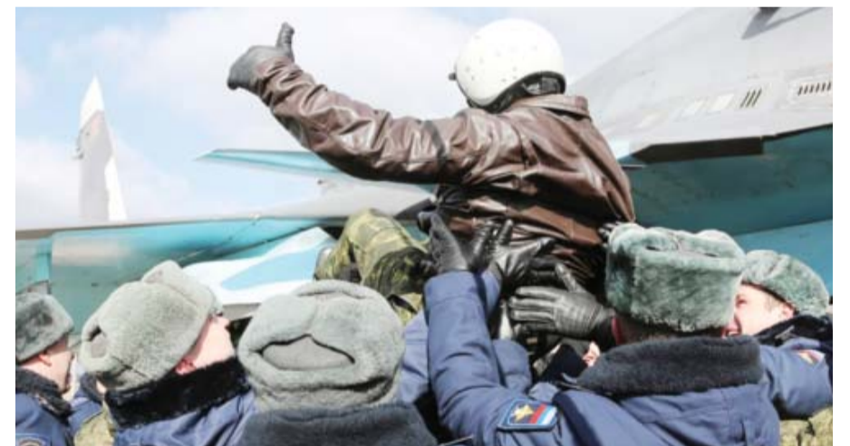
VORONEZH, Russia: A Russian pilot receives a hero's welcome on returning from Syria at an airbase near this Russian city yesterday.