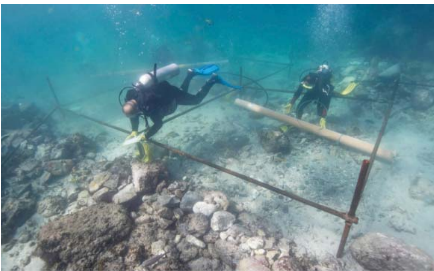
Divers excavate the wreck site of Portuguese explorer Vasco da Gama's ship Esmeralda, which sank in a storm in May 1503 off the coast of Al Hallaniyah island in Oman's Dhofar region.

DUBAI: The 500-year-old wreckage of Portuguese ship piloted by an uncle of explorer Vasco da Gama has been found off the coast of Oman, archaeologists said yesterday, a discovery that included the recovery of an incredibly rare coin. The Esmeralda sank during a violent storm near Al-Hallaniyah Island in the Indian Ocean in May 1503, killing commander Vicente Sodre and all those aboard.