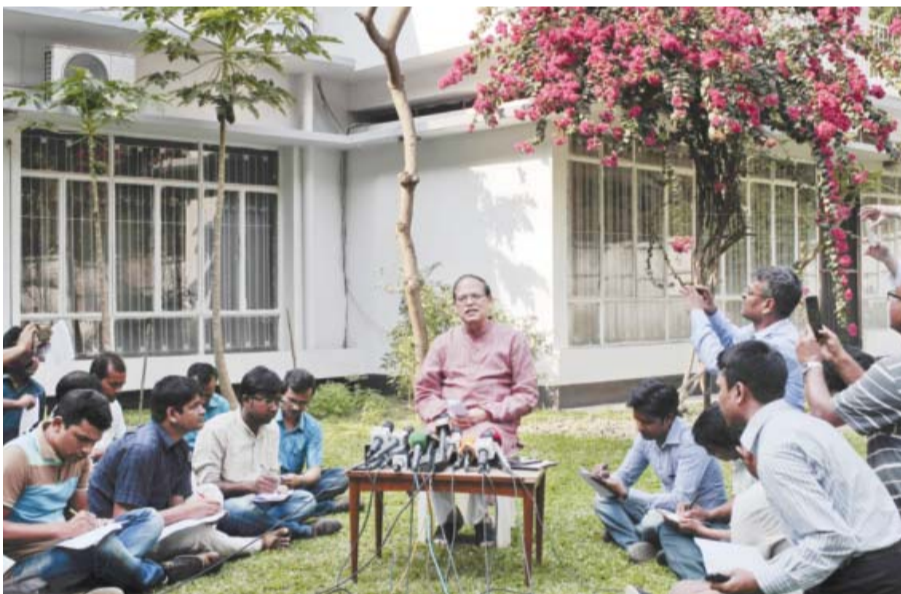
DHAKA: Bangladesh Bank Governor Atiur Rahman, who resigned yesterday, addresses a press conference yesterday.