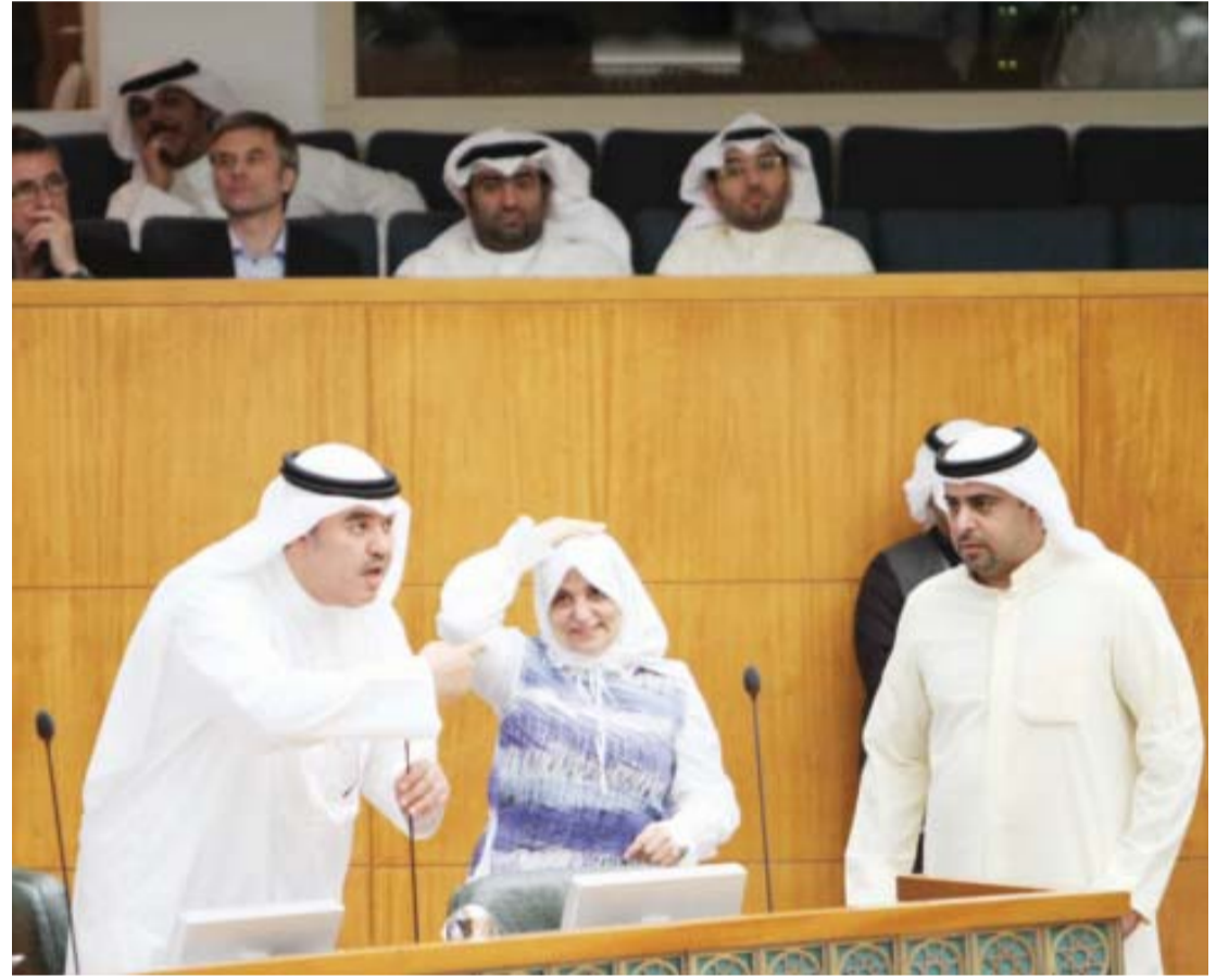
KUWAIT: Minister of Social Affairs and Labor and Planning Hind Al-Subaih gestures during a session at the National Assembly yesterday.

Also during the session, the parliament approved the public prosecution's request to strip MP Abdulhameed Dashti of his parliamentary immunity.