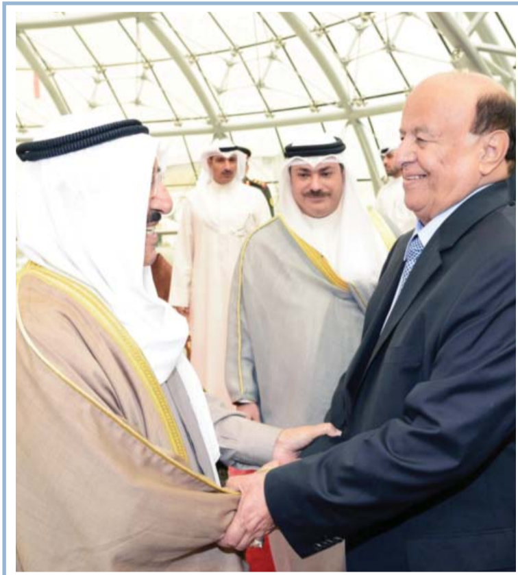
KUWAIT: Yemeni President Abd Rabbuh Mansur Hadi is welcomed by HH the Amir Sheikh Sabah Al-Ahmad Al-Jaber Al-Sabah upon his arrival at Kuwait international airport yesterday on a two-day official visit. (See Page 2)

Min 18° Max 25° High Tide 05:59 & 16:38 Low Tide 11:10