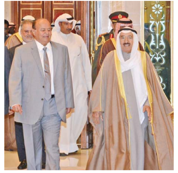
His Highness the Amir Sheikh Sabah Al-Ahmad Al-Jaber Al-Sabah and Yemeni President Abd Rabbuh Mansur Hadi attend a lunch banquet held in Hadi's honor.