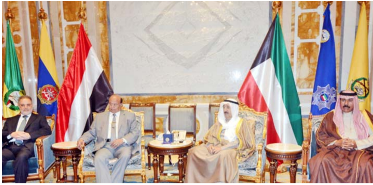
KUWAIT: His Highness the Amir Sheikh Sabah Al-Ahmad Al-Jaber Al-Sabah meets Yemeni President Abd Rabbuh Mansur Hadi, in presence of His Highness the Crown Prince Sheikh Nawaf Al-Ahmad Al-Jaber Al-Sabah.