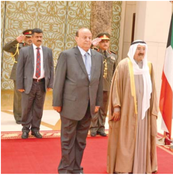
His Highness the Amir Sheikh Sabah Al-Ahmad Al-Jaber Al-Sabah and Yemeni President Abd Rabbuh Mansur Hadi are seen during the official reception ceremonies.