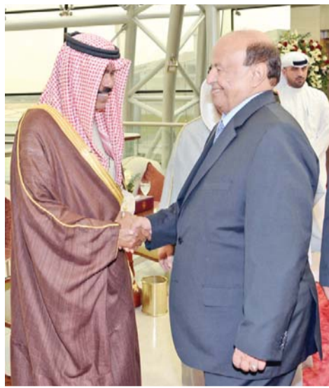
His Highness the Crown Prince Sheikh Nawaf Al-Ahmad Al-Jaber Al-Sabah welcomes Yemeni President Abd Rabbuh Mansur Hadi.