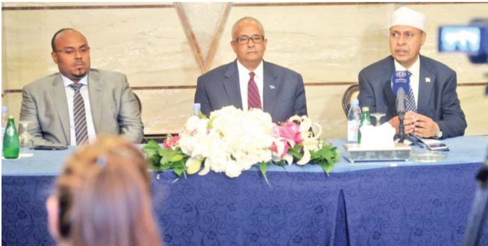
KUWAIT: Somali Foreign Minister Abdusalam Omer (center) attends a press conference held on the occasion of his visit to Kuwait. — KUNA

Omer, meanwhile, said Somalia was making progress in the face of extremist separatists but was in need of political and economic support. He said economic growth in Somalia was 7.3 percent last year, and there were many investment opportunities. Omer said Somalia was in the process of writing a new constitution, forming a government and electing a new parliament. — KUNA