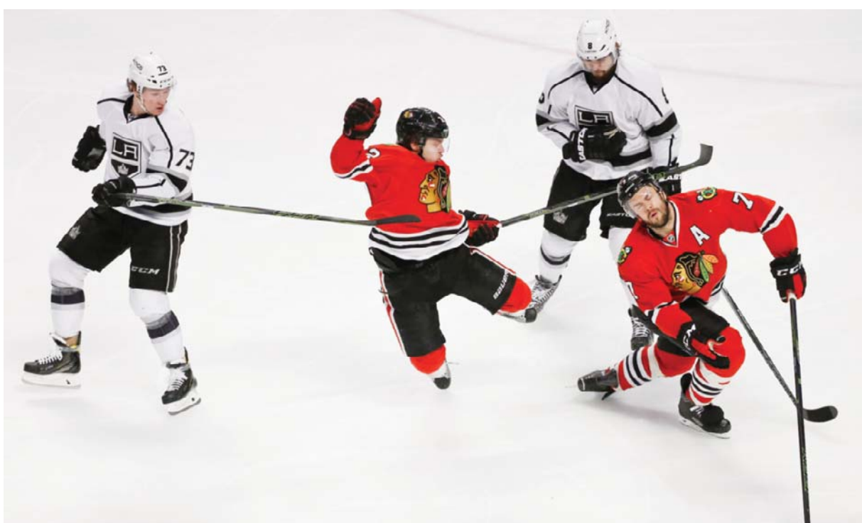
CHICAGO: Chicago Blackhawks defenseman Brent Seabrook (right) collides with left wing Artemi Panarin (second left) while Los Angeles Kings center Tyler Toffoli (left) and defenseman Drew Doughty (second right) looks on during the second period of an NHL hockey game on Monday, March 14, 2016.

Marko Dano had two goals and an assist as Winnipeg beat Vancouver. Tyler Myers and Alexander Burmistrov each added a goal and an assist for the Jets, and Mark Scheifele also scored to extend his points streak to eight games. Mathieu Perreault had two assists and Michael Hutchinson finished with 26 saves. Jared McCann and Jake Virtanen scored for Vancouver, and Jacob Markstrom stopped 24 shots. The Canucks came in having won two straight for the eighth time this season, but failed to get their first three-game winning streak.