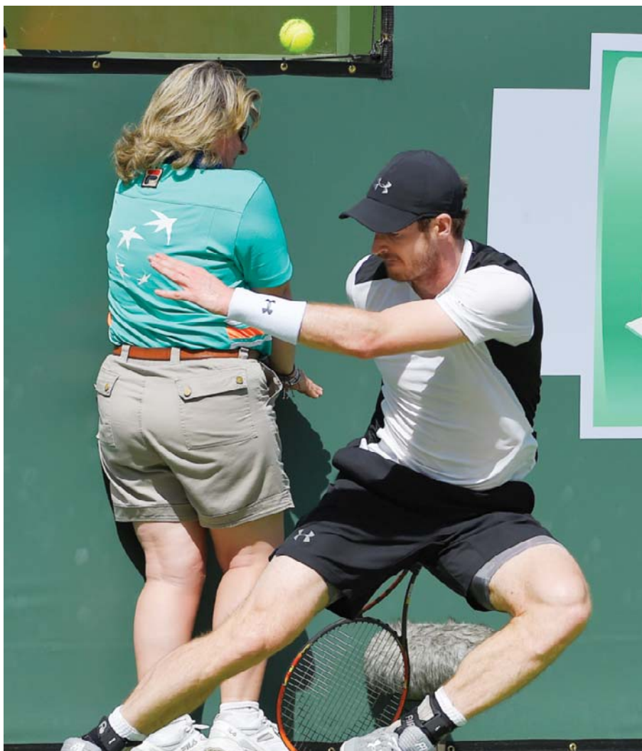
CALIFORNIA: Andy Murray, of Great Britain, attempts to return a shot from Federico Delbonis, of Argentina, during their match at the BNP Paribas Open tennis tournament on Monday, March 14, 2016 in Indian Wells.