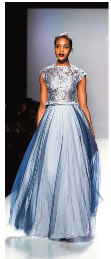
Models walk the runway during the Narcès show at Toronto Fashion Week in Toronto, Monday.