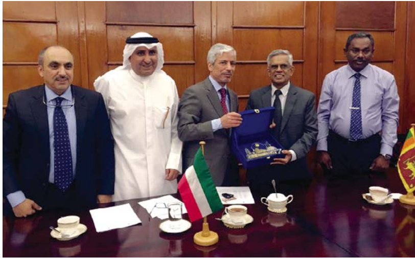
KFAED and Sri Lankan officials pose for a group photo.

The loan agreement was signed on behalf of the Republic of Sri Lanka by Secretary Ministry of