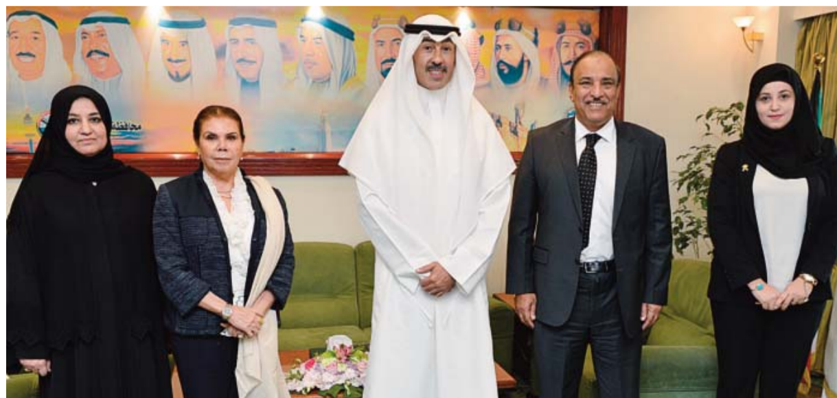
KUWAIT: Ahmadi Governor Sheikh Fawaz Al-Khaled Al-Hamad Al-Sabah met yesterday with members of the Cancer Awareness Nation (CAN) campaign, and congratulated them following the Health Ministry's decision to approve building a radiology cancer treatment center in the governorate.

Horeca Kuwait 2017 is organized by Leaders Group in collaboration with Hospitality Services Company at Mishref International Fair Grounds in the period of January 16-18, 2017 under auspices of the Minister of Information and Minister of State for Youth Affairs Sheikh Salman Al-Humoud Al-Sabah.