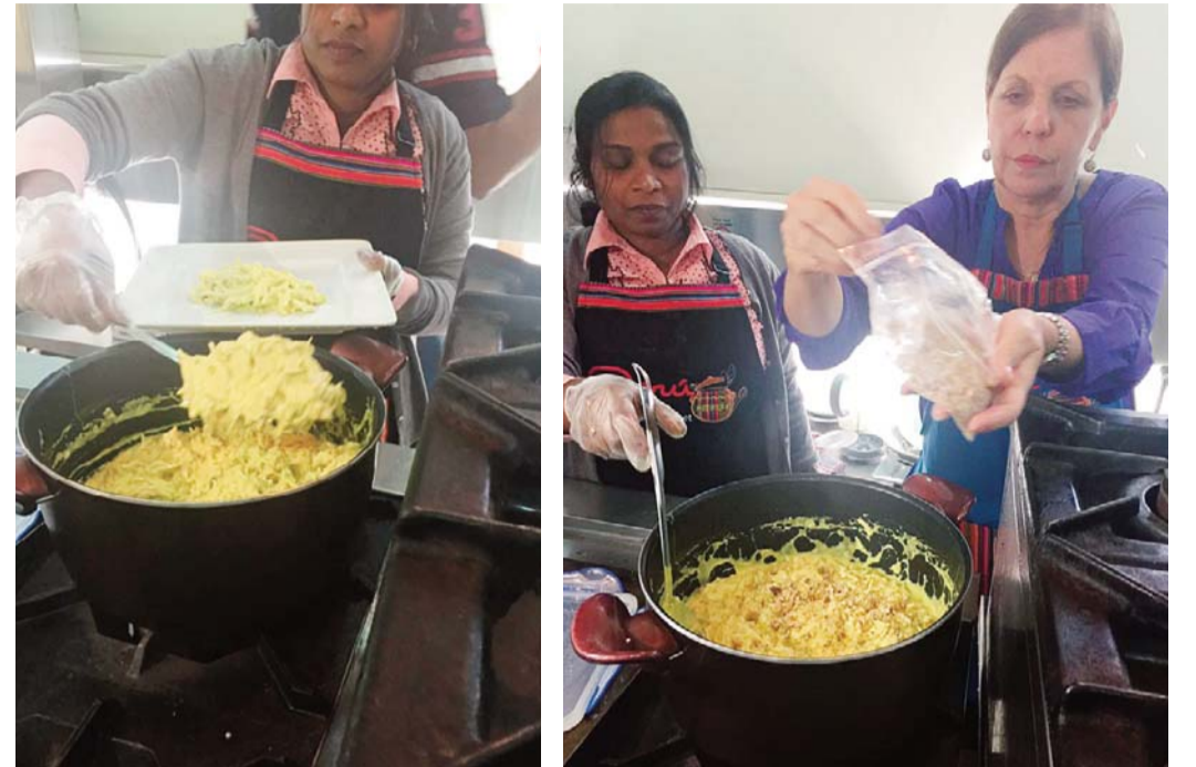
The wife of the Peruvian Ambassador to Kuwait invited fellow International Women's Group members to a Peruvian cooking show hosted at Ruby Tuesday recently.