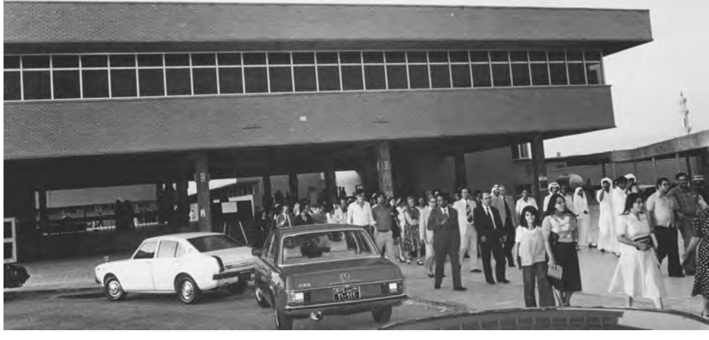
KUWAIT: Archive photos showing students from different eras throughout Kuwait University's history.