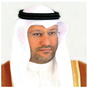
Health Minister Dr Ali Al-Obaidi

KUWAIT: Minister of Health Dr Ali Al-Obaidi said the decisions on overseas medical treatment are bound to specific technical criteria and fall in the framework of a practical system. "Such decisions are made without interferences by a minister. I have decided to refer a number of medical offices to prosecution over reported irregularities in this regard," he said. The minister made the comments in an interview with 'Ommah 2016' program on Al-Rai TV station on Friday night. The overseas medical treatment is one of a range of services being offered by the Ministry of Health since the ministry was founded long years