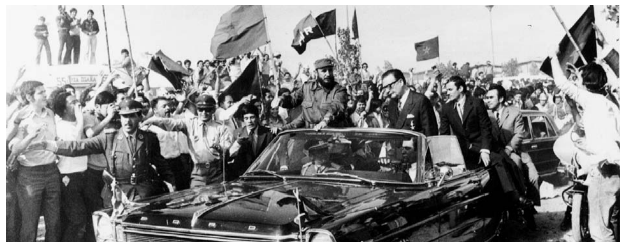
In this Nov 10, 1971 file photo, Castro (center left) rides with Chile's President Salvador Allende through a crowd waving communist flags in Santiago, Chile.

"The next president can reverse them, and that I will do unless the Castro regime meets our demands," Trump told supporters. A bloc of mostly Republican Cuban-American lawmakers has worked to keep tight restrictions on trade and travel with Cuba for years. Some Republican lawmakers broke with party orthodoxy to back Obama's reforms, drawn by the economic benefits of restoring ties.— Reuters