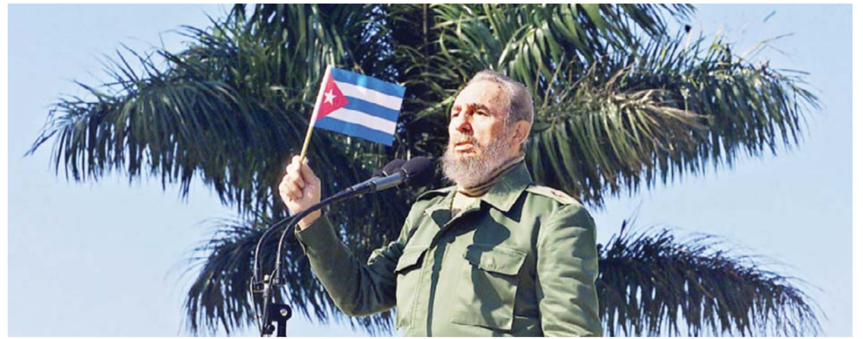
This file photo taken on Jan 26, 2001 shows Castro waving a flag during a visit to the Havana neighborhood of San Jose de las Lajas.

Syria President Bashar Al-Assad: Assad said in a telegram to the Cuban leadership: "Cuba, our friend, managed under his leadership to withstand the strongest sanctions and oppressive campaigns witnessed in our recent history, becoming a beacon of liberation for the people of South America, and the people of the entire world. Fidel Castro's name will live forever in the minds of generations and will inspire those aspiring to true independence and liberation from the yoke of colonialism and hegemony." — Agencies