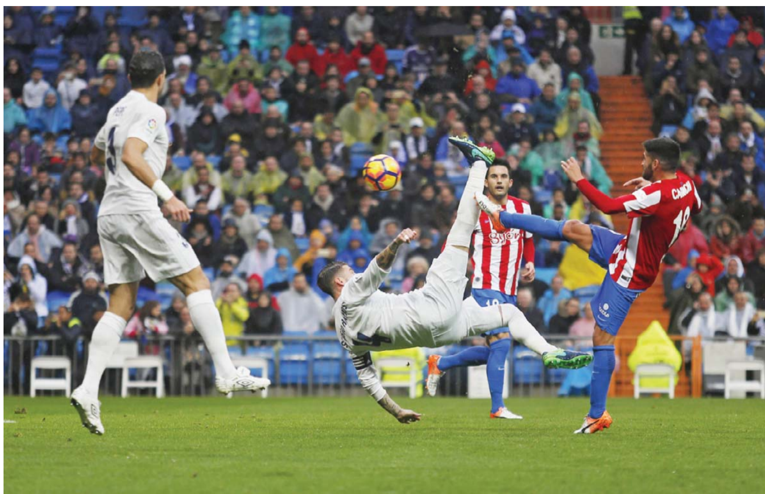
MADRID: Real Madrid's Sergio Ramos, centre, attempts an over heard kick next to Sporting's Carlos Carmona, right, during a Spanish La Liga soccer match between Real Madrid and Sporting at the Santiago Bernabeu stadium in Madrid, yesterday. Real Madrid won 2-1.