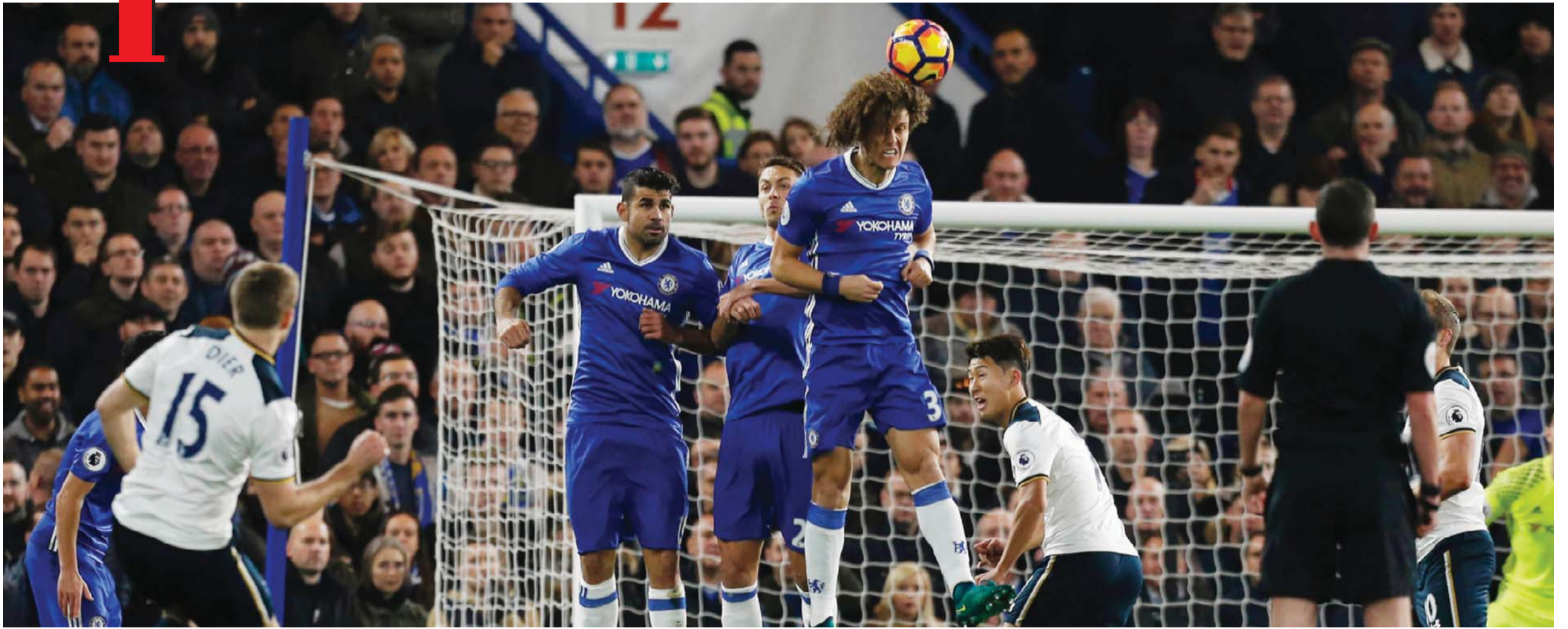
LONDON: A free kick from Tottenham Hotspur's English defender Eric Dier (L) clears the wall over Chelsea's Brazilian defender David Luiz (C) to go over the bar during the English Premier League football match between Chelsea and Tottenham Hotspur at Stamford Bridge in London yesterday.