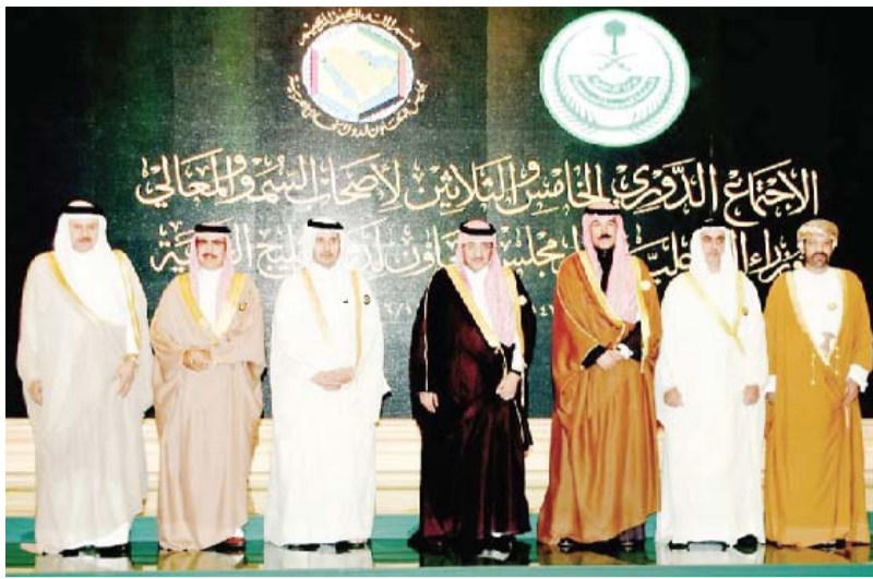
RIYADH: Kuwait's Interior Minister Sheikh Mohammad Al-Khaled Al-Sabah (third from right) is pictured among participants in the 35th meeting of Gulf Cooperation Council (GCC) Interior Ministers meeting.