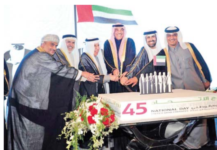
KUWAIT: The United Arab Emirates' Ambassador to Kuwait Rahma Al-Zaabi hosted a reception Monday night to celebrate his country's national day. Top state officials led by First Deputy Prime Minister and Foreign Minister Sheikh Sabah Al-Khaled Al-Hamad Al-Sabah, diplomats and other dignitaries attended the event.