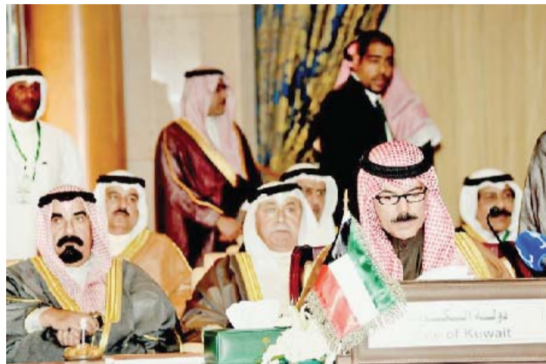
Deputy Prime Minister and Interior Minister Sheikh Mohammad Al-Khaled Al-Hamad Al-Sabah attends the meeting.