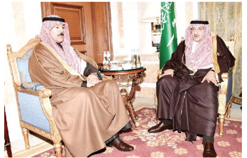
Deputy Prime Minister and Interior Minister Sheikh Mohammad Al-Khaled Al-Hamad Al-Sabah meets with Saudi Crown Prince, Deputy Prime Minister and Interior Minister Prince Mohammad bin Nayef.