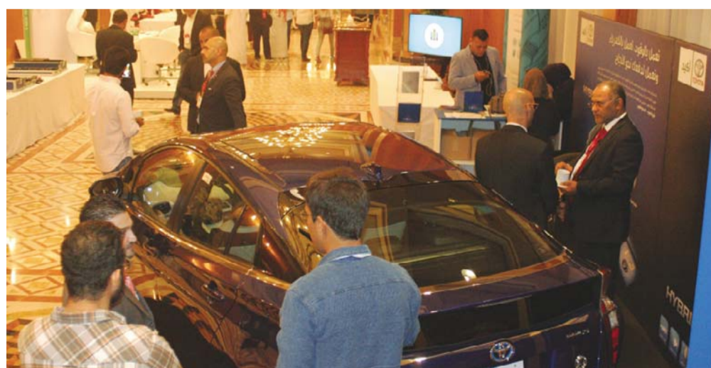
The Prius display stand at Tmkeen Youth Symposium.

The symposium delivered outstanding knowledge to the talented young people to progress in their fields of interest and trigger their enthusiasm. This year Tmkeen Youth Empowerment Symposium showcased renowned international and local industry pioneers, creative leaders and professionals. Attendees benefitted from the lectures of