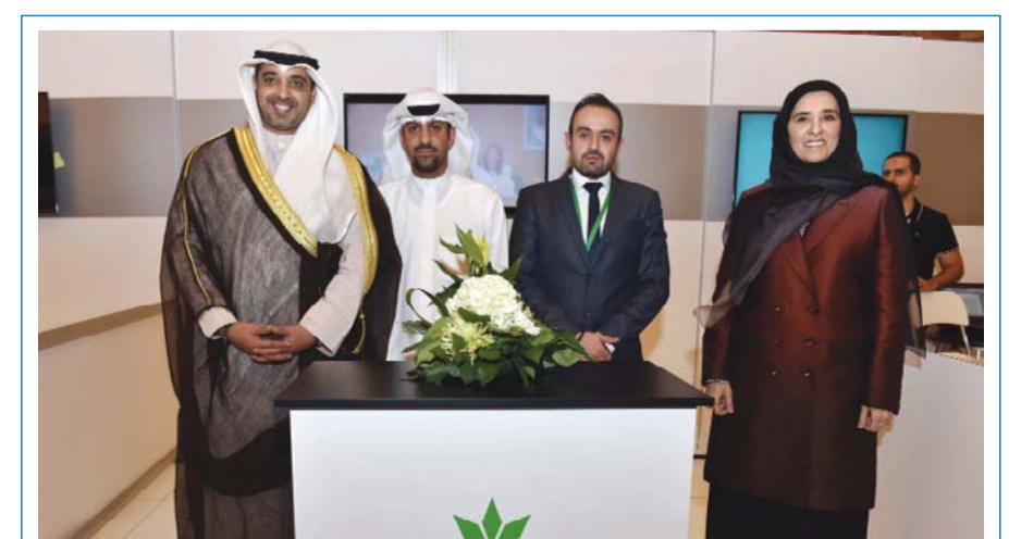
KUWAIT: The Commercial Bank of Kuwait (CBK) took part in the 2016 Global Informatics Forum (GIF) which took place recently under the auspices of His Highness the Amir Sheikh Sabah Al-Ahmad Al-Sabah. The event was organized by the Salem Al-Ali Informatics Award under the title of 'Digital Transformation toward Knowledge Economy'. CBK provided silver sponsorship for the event.