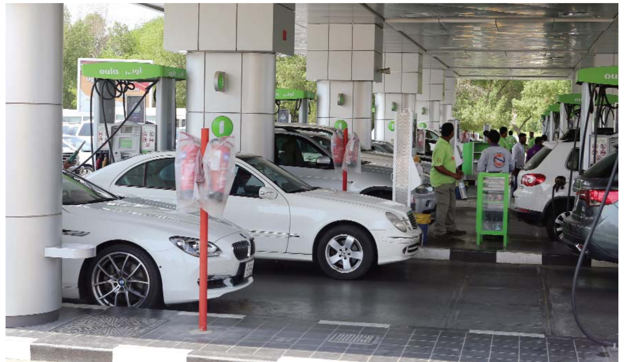
KUWAIT: Drivers queue up to fill their cars with fuel at petrol stations in Kuwait City yesterday on the eve of increased petrol prices. The Kuwaiti cabinet decided on August 1, 2016 to raise petrol prices by more than 80 percent from September 1 as part of economic reforms aimed at countering falling oil revenues. These are the first increases in heavily subsidized petrol prices in the OPEC member for almost two decades. The oil-rich Gulf state liberalized the prices of diesel and kerosene in January 2015 and revises their prices monthly.