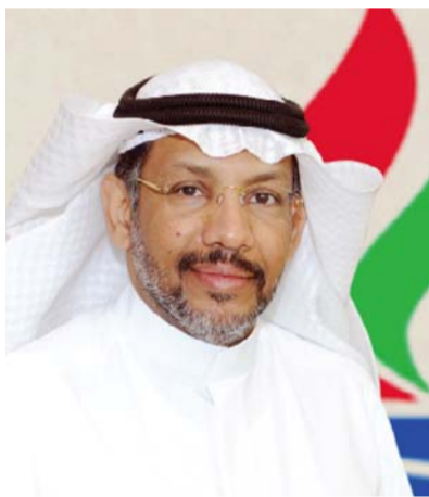
KNPC's CEO Mohammad Al-Mutairi

In 2011, consumption rates were recorded at over 3,531 billion liters, about 3,682 billion liters in 2012, 3,810 billion liters in 2013, 4,006 billion liters in 2014 and over 4,122 billion liters in 2015. The new pricing is close to international rates, said the official, noting that Octane-91 and Octane-95 are state-subsidies.