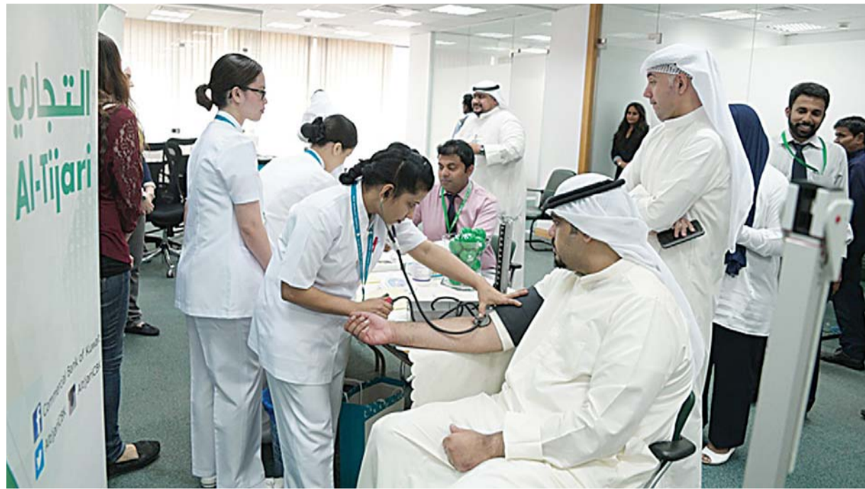
KUWAIT: The Commercial Bank of Kuwait (CBK) welcomed a team from New Mowasat Hospital, who gave medical checkups and health advises to staff members.