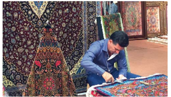
Photos shows Persian carpets in Iran.

Weaving carpets is an old art and craft which dates back to the dawn of human civilization. Persian carpets, known worldwide for their value, beauty, and durability, are one of the most prestigious items produced by Iran. Carpets are an essential part of any Iranian household and some pieces are so expensive that people would usually present them as valuable gifts during weddings and other joyous occasions. — KUNA