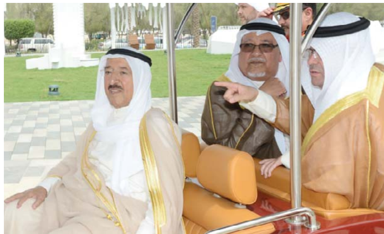
His Highness the Amir Sheikh Sabah Al-Ahmad Al-Jaber Al-Sabah tours the second phase of Al-Shaheed Park.