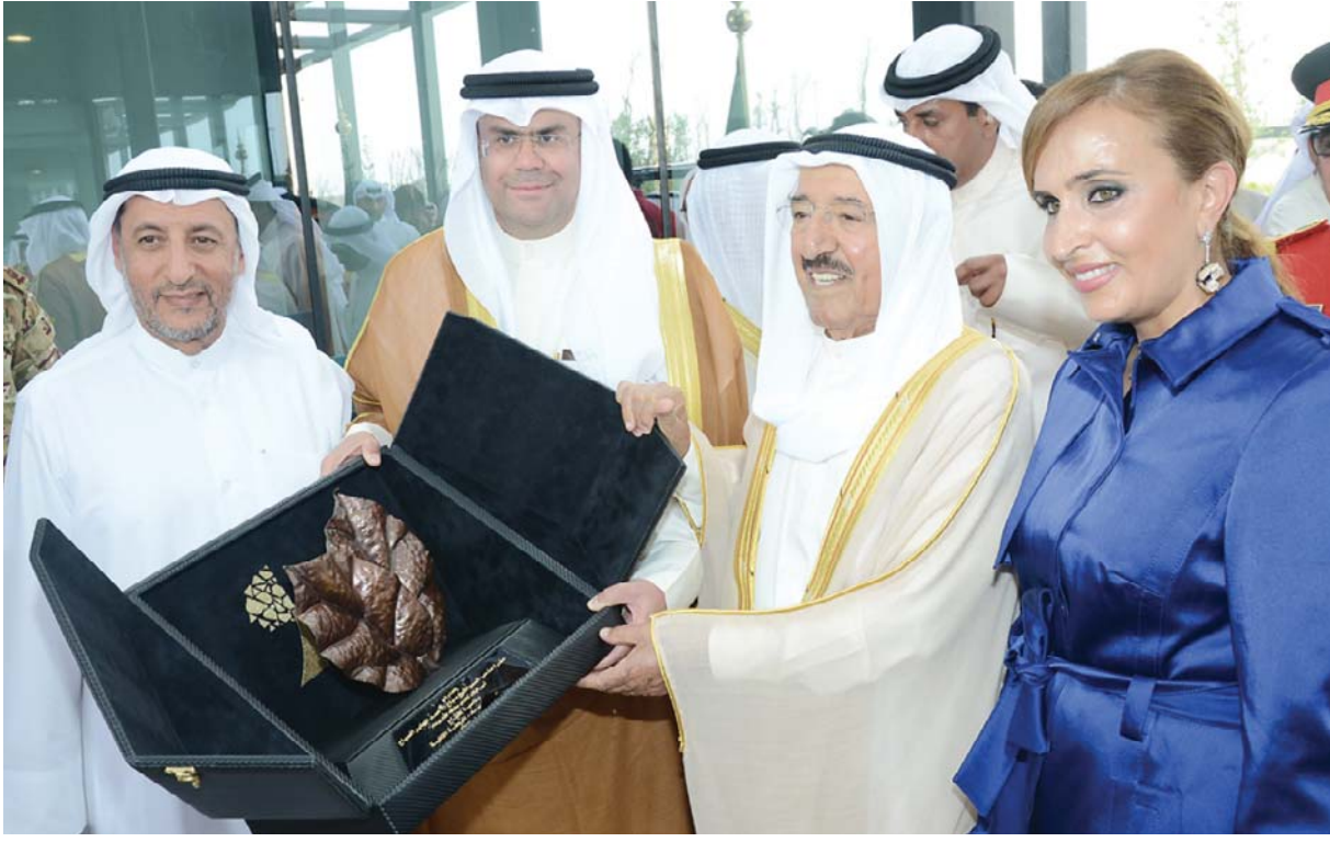
KUWAIT: His Highness the Amir Sheikh Sabah Al-Ahmad Al-Jaber Al-Sabah is presented with a gift during the opening of the second phase of Al-Shaheed Park.