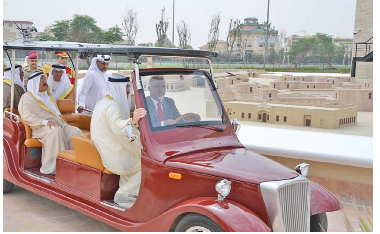
His Highness the Amir Sheikh Sabah Al-Ahmad Al-Jaber Al-Sabah tours the second phase of Al-Shaheed Park.