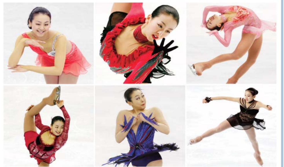
SOCHI: In this combination of six file photos, Japan's figure skater Mao Asada performs, clockwise from top left to right, at the ISU figure skating Grand Prix Final in Sochi, Russia, Dec. 7, 2012, at the Japan National Figure Skating Championships in Osaka, Japan, Dec. 27, 2009, at the Japan National Figure Skating Championships in Osaka, Dec. 26, 2009, at the Eric Bompard Trophy Figure Skating Grand Prix in Paris, Nov. 15, 2008, at the 2014 Winter Olympics in Sochi, Feb. 20, 2014, and at the World Figure Skating Championships in Turin, Italy, March 26, 2010. The 26-year-old Asada, the three-time world champion announced her retirement yesterday in a press conference.

South Korea's Kim Yuna at the start of a long rivalry. Kim and Asada's rivalry reached a head at the 2010 Winter Games in Vancouver, when Asada had to settle for silver while Kim claimed gold. Asada was tipped as a leading medal contender at the 2014 Sochi Olympics but had a disastrous short programme, although she rebounded with a strong free skate to finish sixth overall. "After the short programme, I thought I wouldn't be able to return to Japan, and the morning of the free skate I woke still feeling that way," she said. "But the moment I stepped out on the rink I just thought I'd have to do it, and give it everything I had." Asked about her future plans, Asada said she's taking part in an ice show this summer but is still thinking about the rest. "I've been skating since I was five and have gained so much from it," she said. "So I want to do something, in some form, to give back to the sport." — Reuters