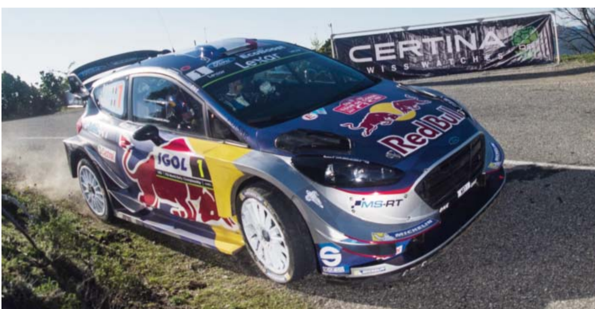
Sebastien Ogier (FRA) performs during the FIA World Rally Championship 2017 in Bastia, France on April 9, 2017

Meeke took the lead on the opening day of the rally and was pulling out an advantage before an engine problem stopped him halfway through the opening day. This gave Neuville the lead, chased down by reigning world champion Sebastien Ogier. However, Ogier was delayed by a hydraulic problem and then an intermittent electrical fault on the final day of the rally, which contained the longest stage at 53 kilometers. The Frenchman managed to seal the runner-up spot from Hyundai's Dani Sordo by less than two seconds, while Neuville claimed his first win of the year by nearly a minute.