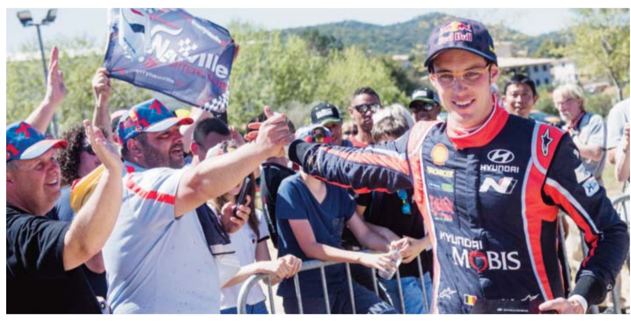
Thierry Neuville (BEL) celebrates the podium during the FIA World Rally Championship 2017 in Bastia, France on April 9, 2017