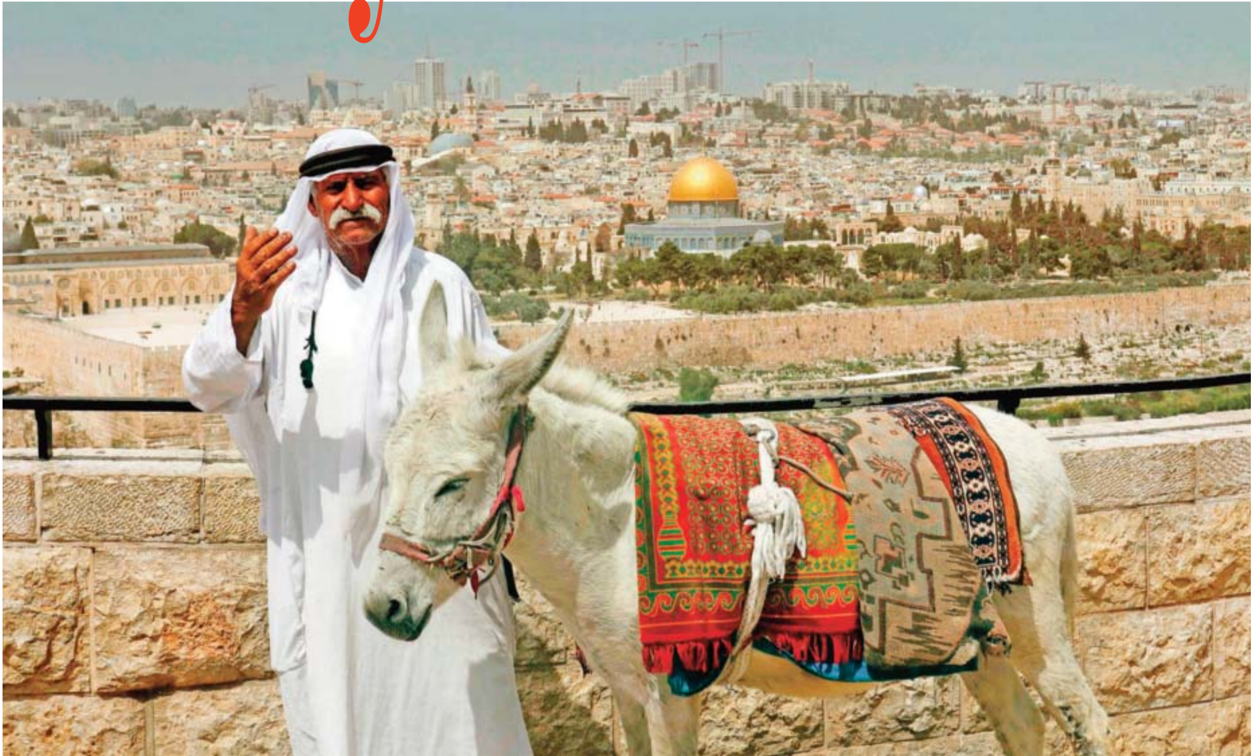
A Palestinian man with his donkey poses at the panoramic view from the Mount of Olives on the Old City of Jerusalem, with the Muslim Dome of the Rock in the background.